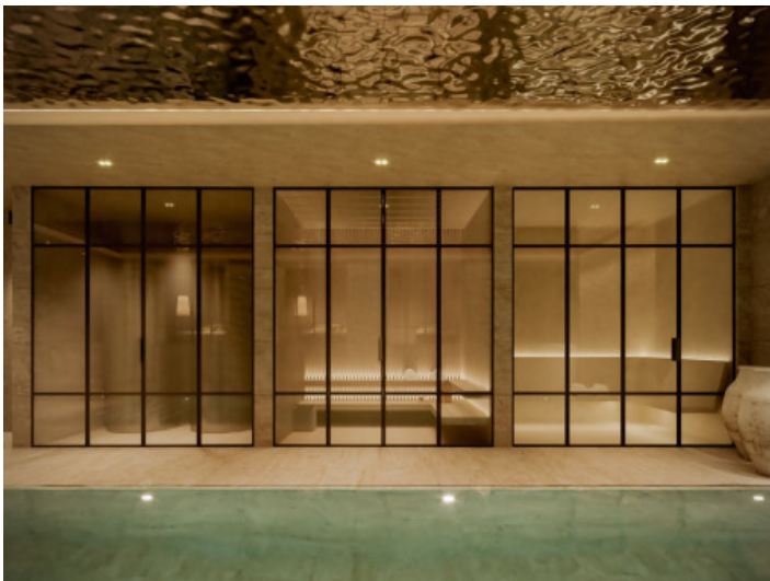
Spa and pool