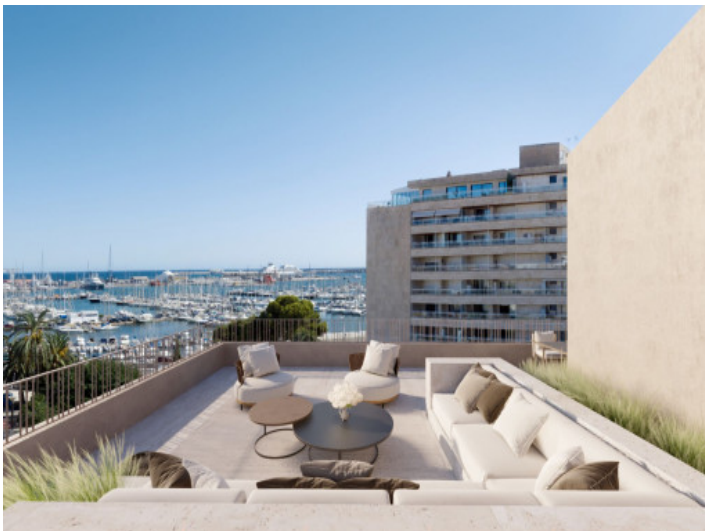
Outdoor terrace with Lounge and Harbor View