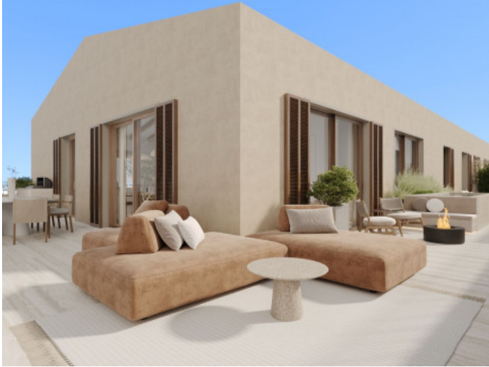
Terrace with lounge