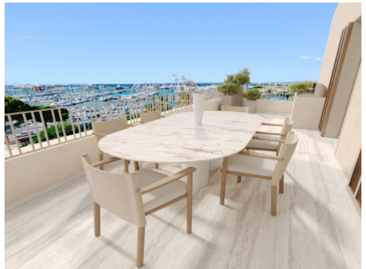
Outdoor terrace with Dining Area