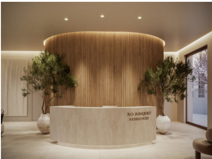
Entrance area of the property