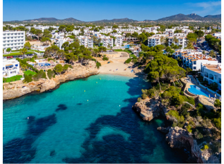
Close to the beach