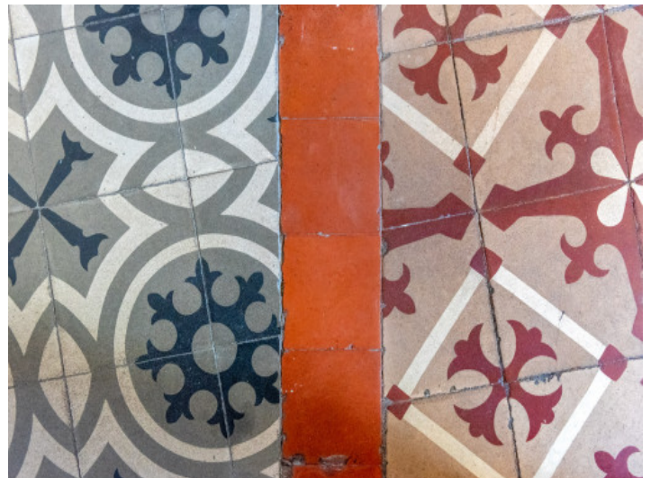
Original floor tiles