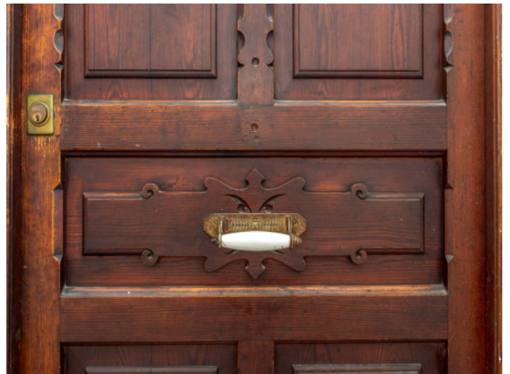
Original wooden doors