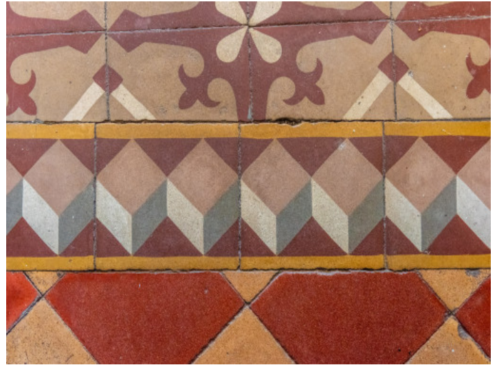
Original mallorcan floors