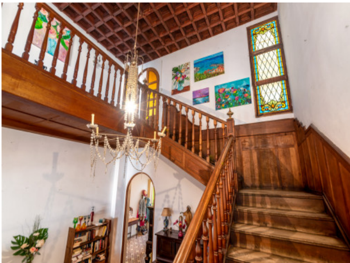
Impressive wooden staircase