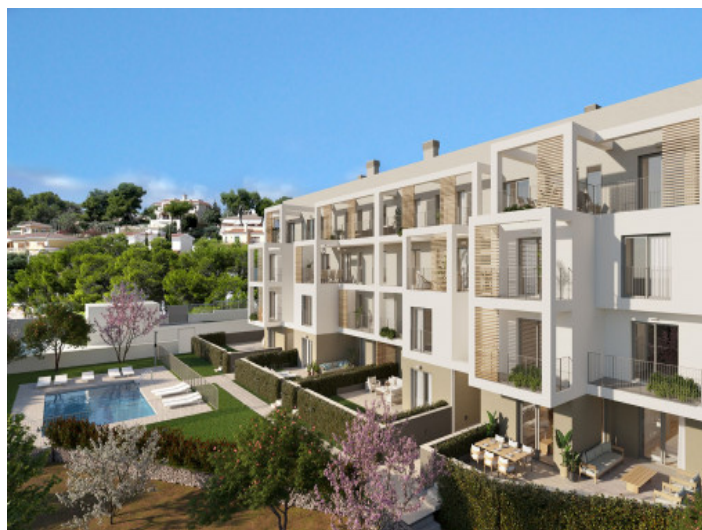
Pool and garden area

All information is correct to the best of our knowledge. Errors and prior sale excepted. This prospectus is purely for information purposes. Only the notarized deed of sale is legally binding.