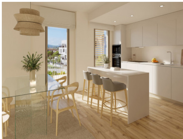
Dining and kitchen area