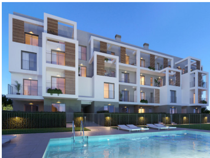
View to the building

All information is correct to the best of our knowledge. Errors and prior sale excepted. This prospectus is purely for information purposes. Only the notarized deed of sale is legally binding.