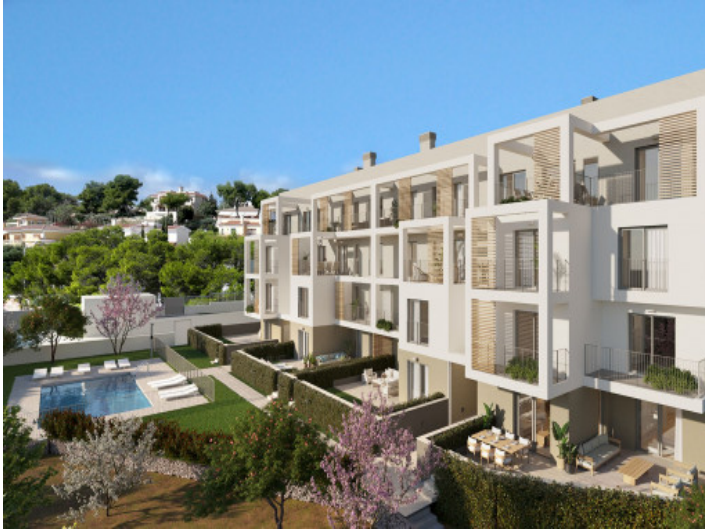
View to the comunal area and building