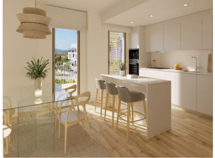
Dining and kitchen area