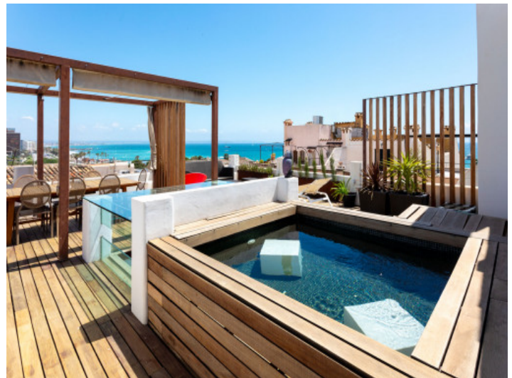
Rooftop with pool