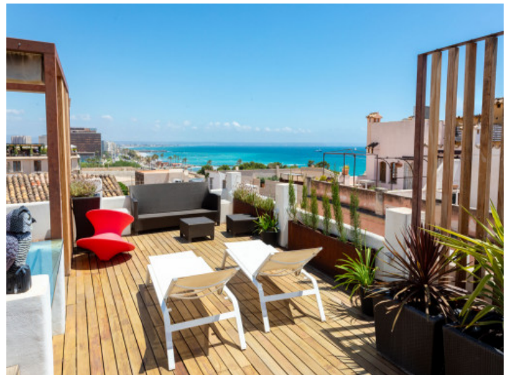
Close to the beach