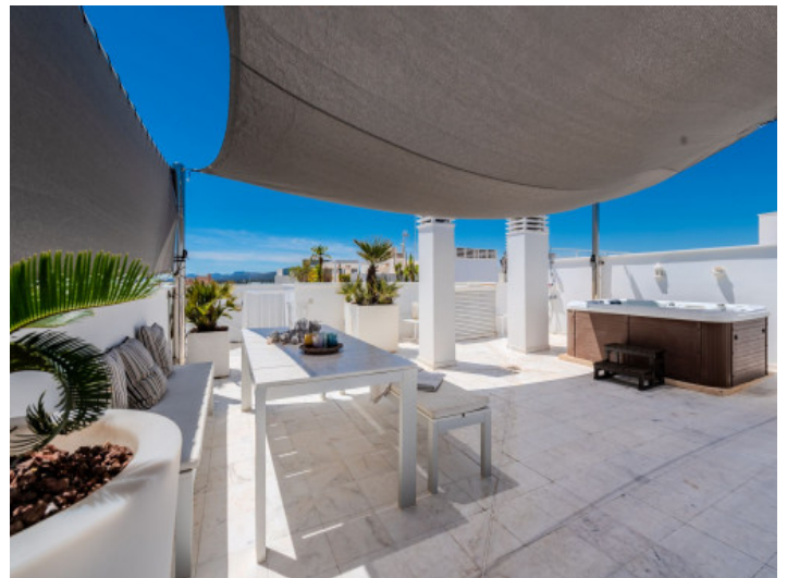
Rooftop terrace with jacuzzi