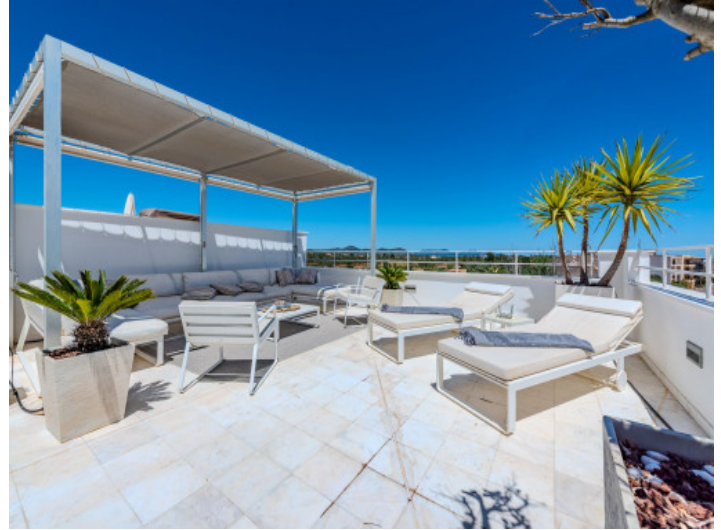
Amazing rooftop terrace