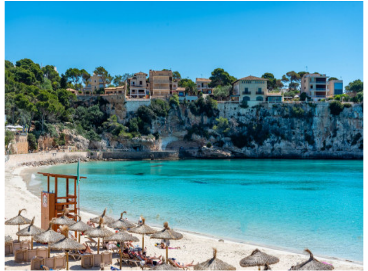
Beach at Porto Cristo