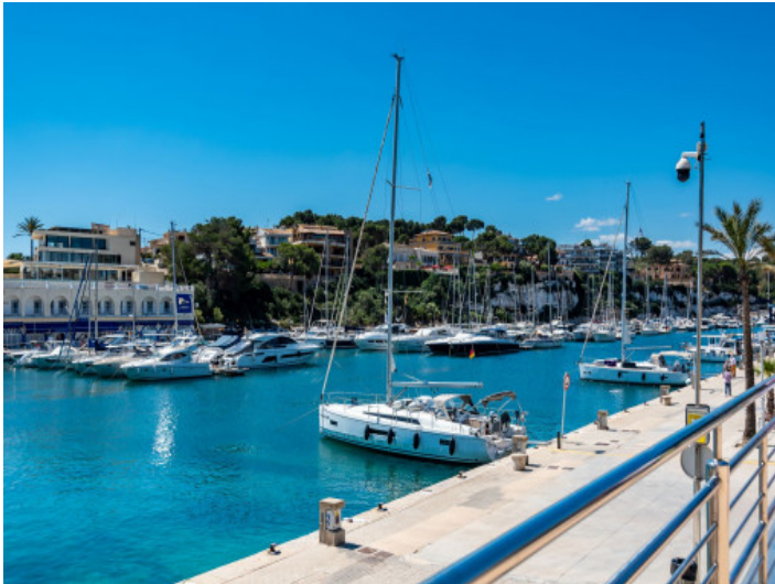
Harbour of Porto Cristo