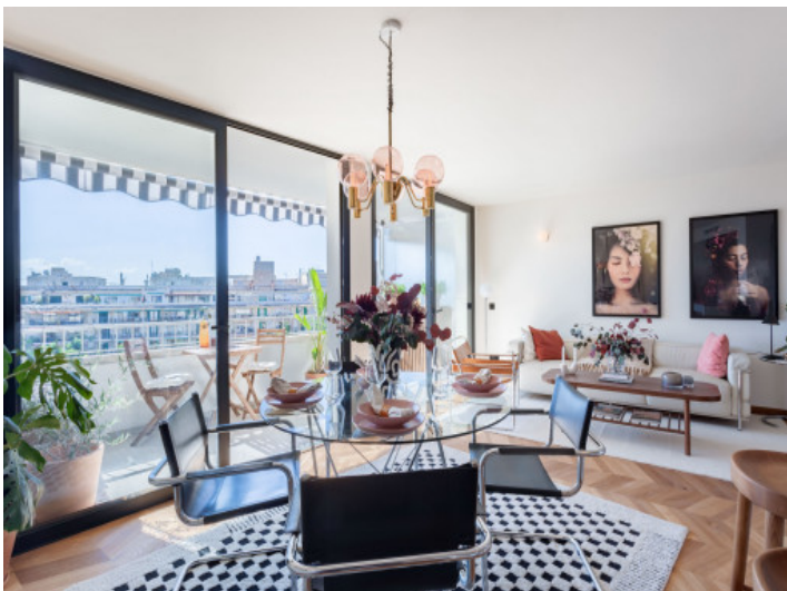
Elegant living area