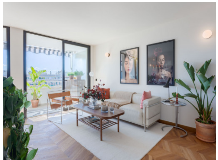
Living area with direct access to the terrace

All information is correct to the best of our knowledge. Errors and prior sale excepted. This prospectus is purely for information purposes. Only the notarized deed of sale is legally binding.