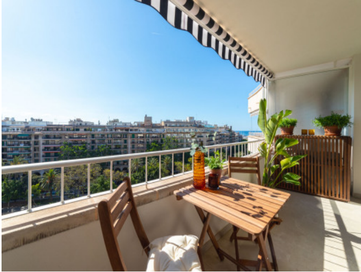
Partial sea view