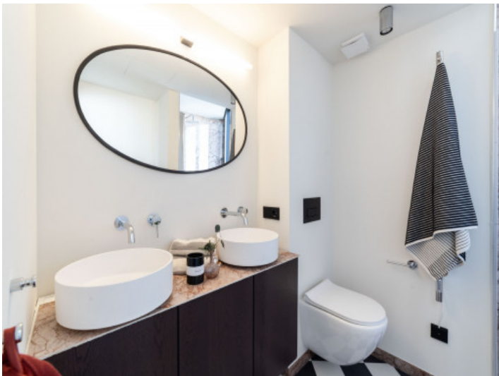
Bathroom en suite