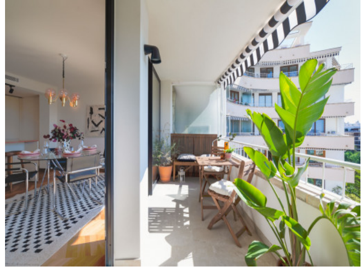
Mallorcan city lifestyle