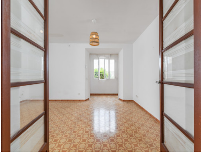
View to the living area