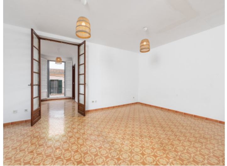
Large living area