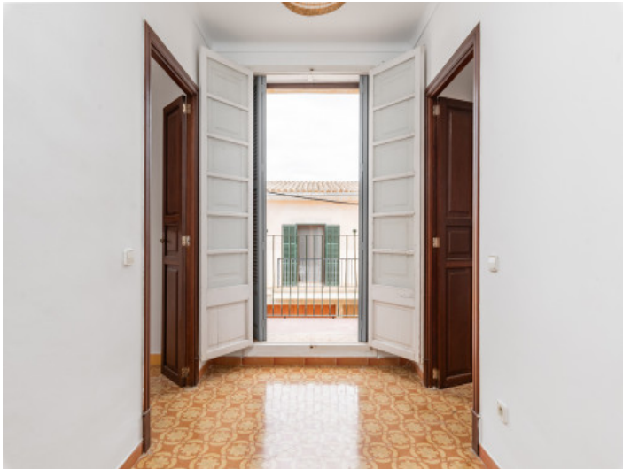
Hallway to the 2 bedrooms