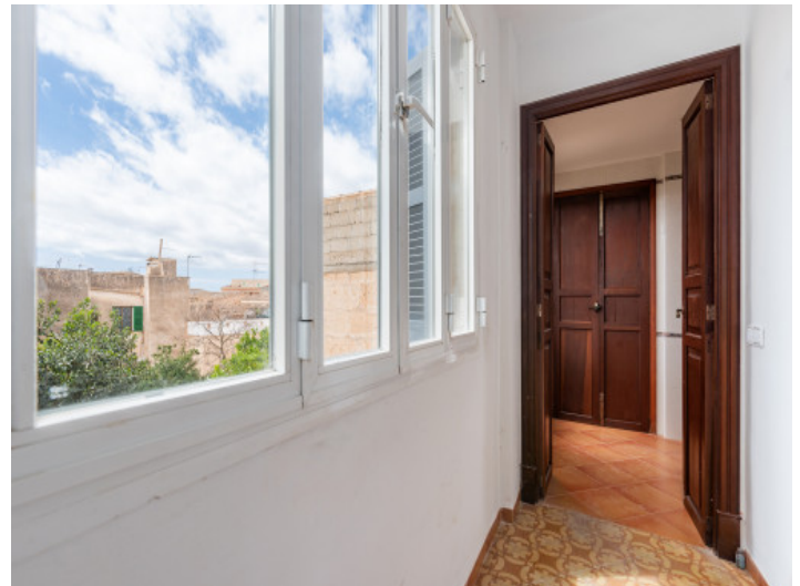
Hallway connecting kitchen, living area and bathroom

All information is correct to the best of our knowledge. Errors and prior sale excepted. This prospectus is purely for information purposes. Only the notarized deed of sale is legally binding.