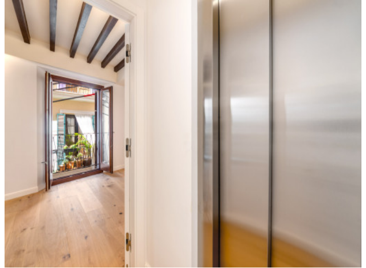
Direct elevator access