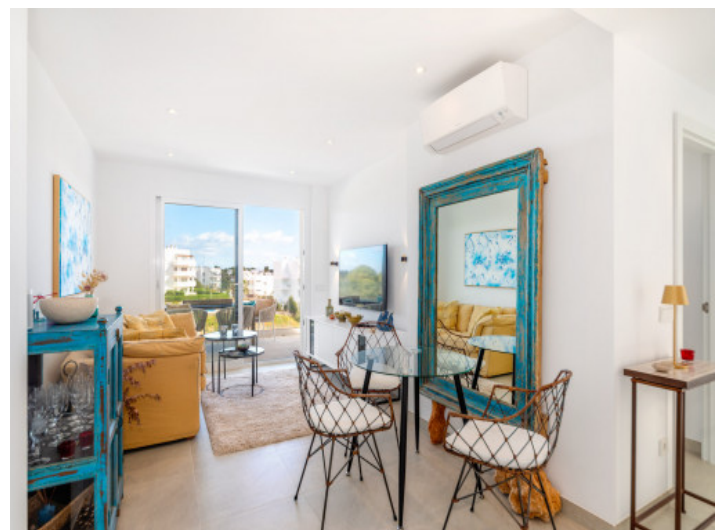
Living and dining room

All information is correct to the best of our knowledge. Errors and prior sale excepted. This prospectus is purely for information purposes. Only the notarized deed of sale is legally binding.