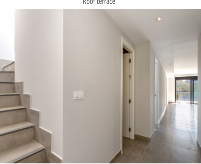
Roof terrace Hallway All information is correct to the best of our knowledge. Errors and prior sale excepted. This prospectus is purely for information purposes. Only the notarized deed of sale is legally binding.

PORTA MALLORQUINA • C./ CONQUISTADOR 8, 07001 PALMA TEL. +34 971 698 242 • INFO@PORTAMALLORQUINA.COM