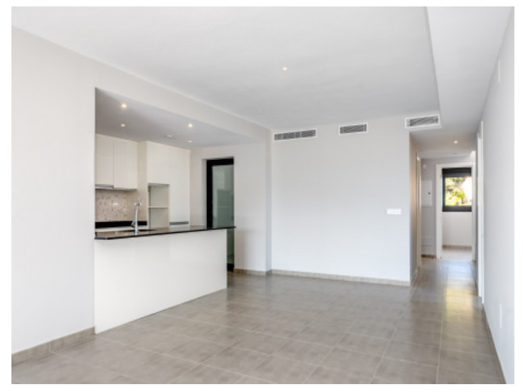
Living area and kitchen