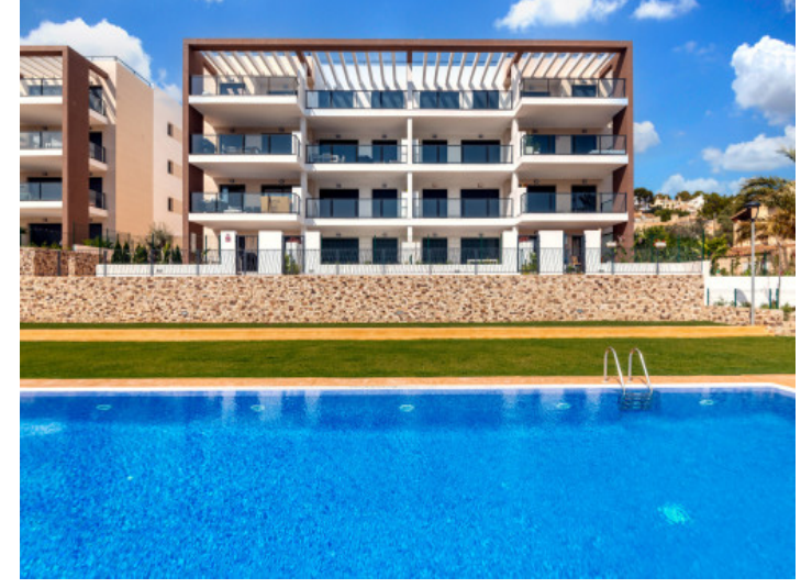
Complex and pool

PORTA MALLORQUINA® Your home. Our passion.