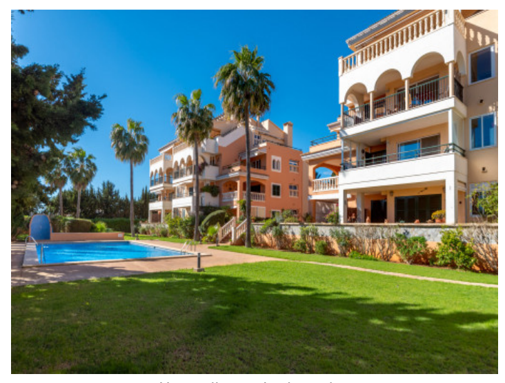
Very well mantained complex