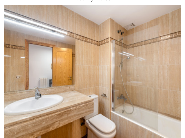
Bathroom with bathtub