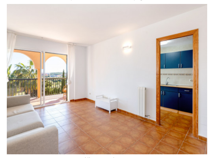
Nice room layout