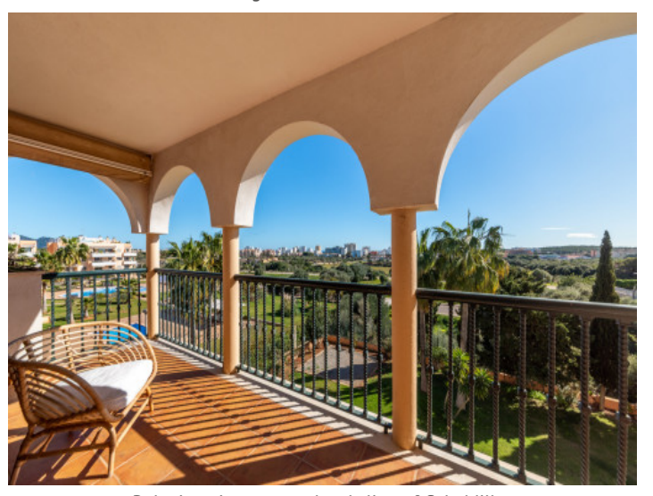
Relaxing views up to the skyline of Cala Millor