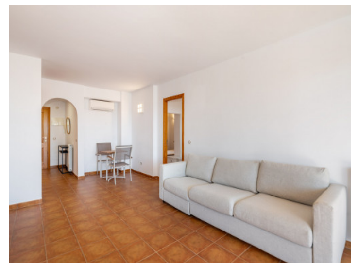
Bright living and dining area