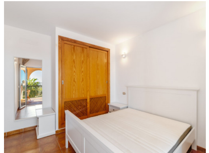
Large built-in wardrobe