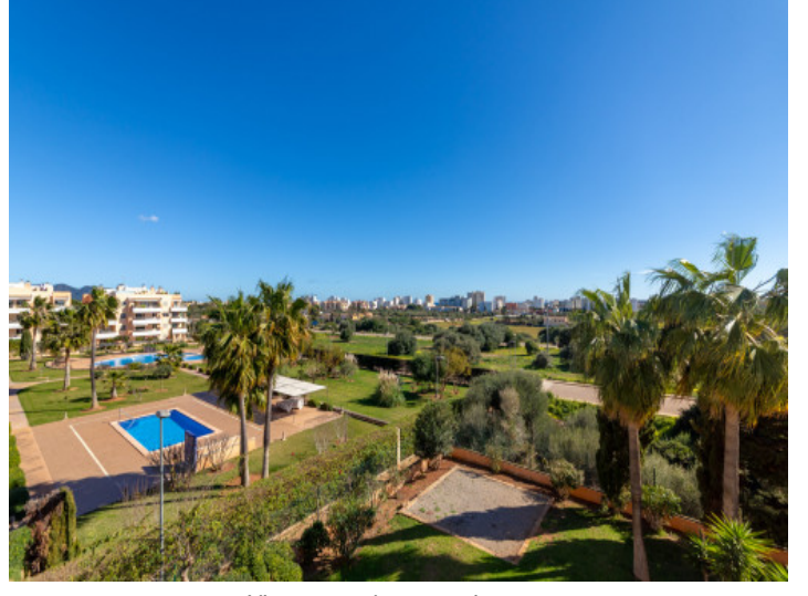
Views over the comunity area

All information is correct to the best of our knowledge. Errors and prior sale excepted. This prospectus is purely for information purposes. Only the notarized deed of sale is legally binding.