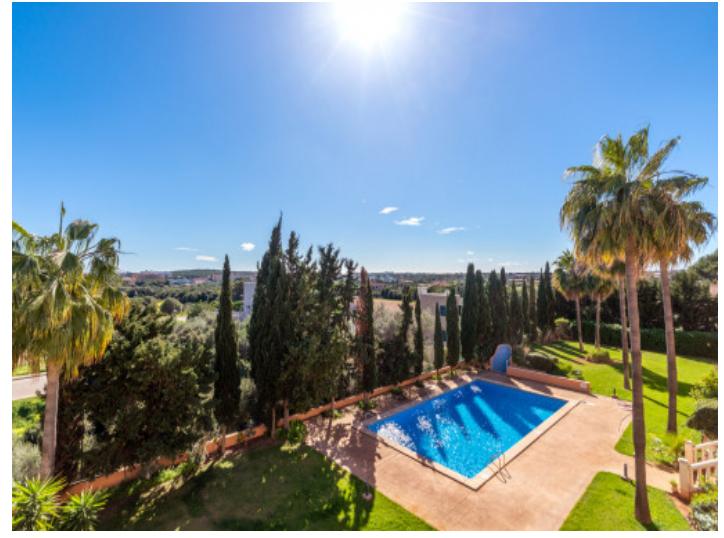
Views from the balcony