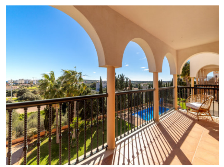
Large sunny balcony