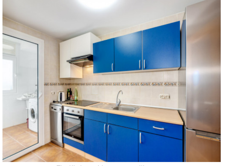
The Kitchen with seperate utility room

All information is correct to the best of our knowledge. Errors and prior sale excepted. This prospectus is purely for information purposes. Only the notarized deed of sale is legally binding.