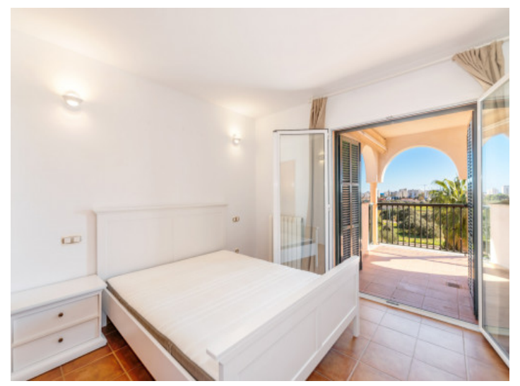
The sunny bedroom