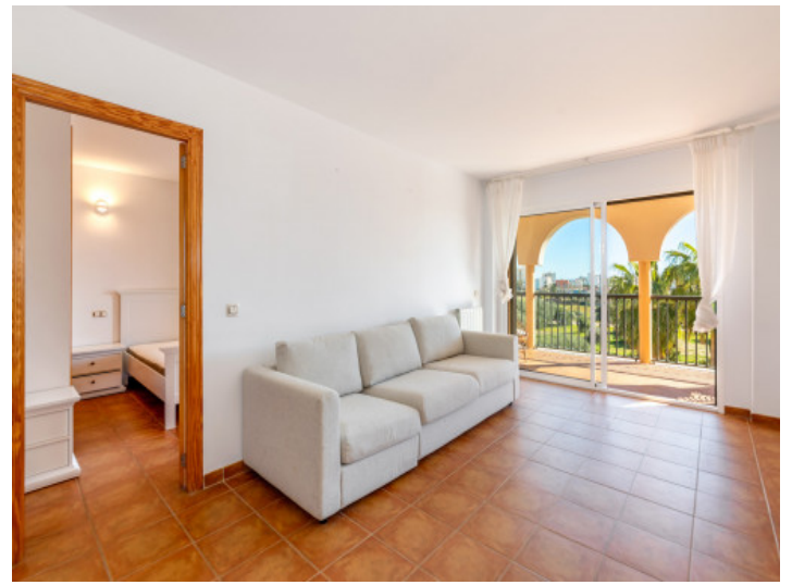
Apartment with lots of daylight