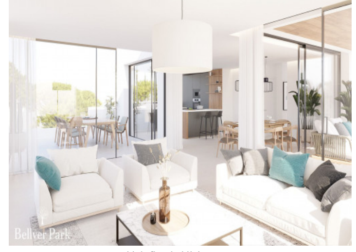
Lightflooded living area