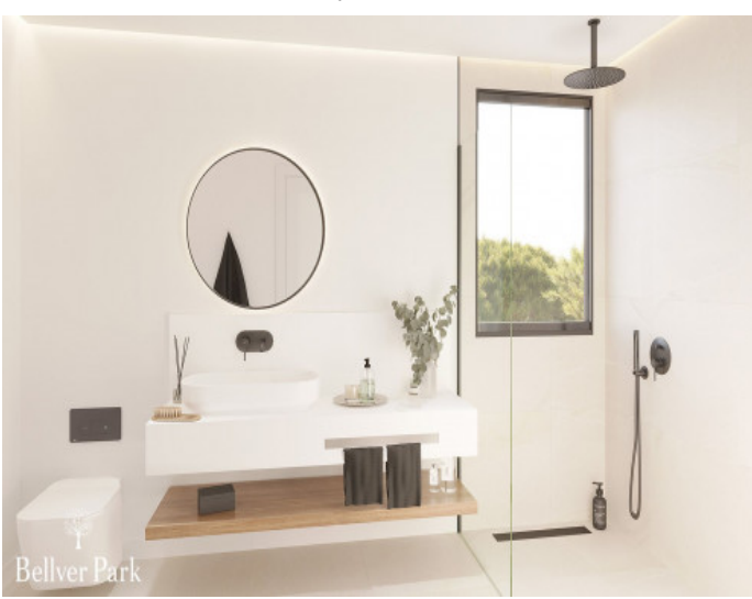
Bathroom with daylight

All information is correct to the best of our knowledge. Errors and prior sale excepted. This prospectus is purely for information purposes. Only the notarized deed of sale is legally binding.