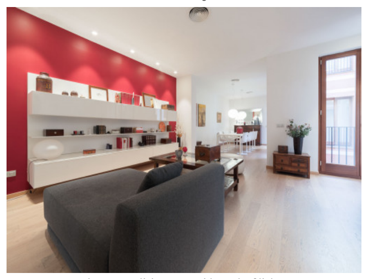
Large cozy living room with much of light