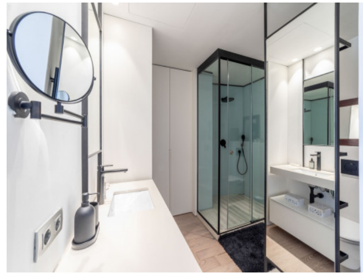
Modern en suite bathroom