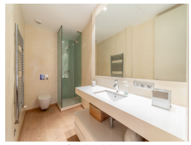
Bright shower bathroom