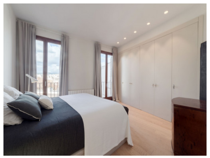
Comfortable bedroom with built in wardrobes