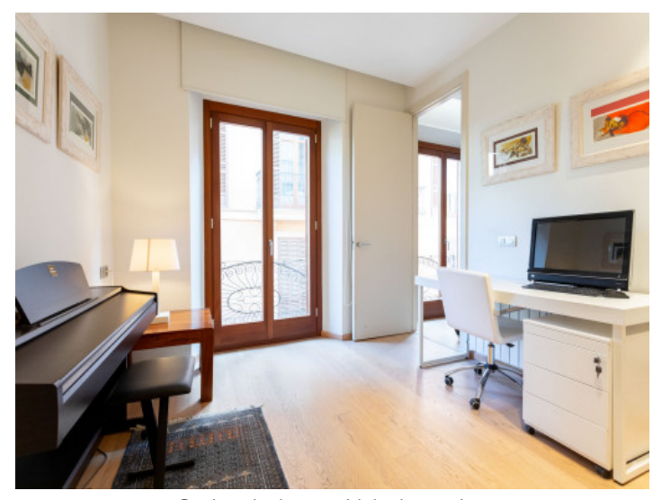
Study or bedroom with bath en suite