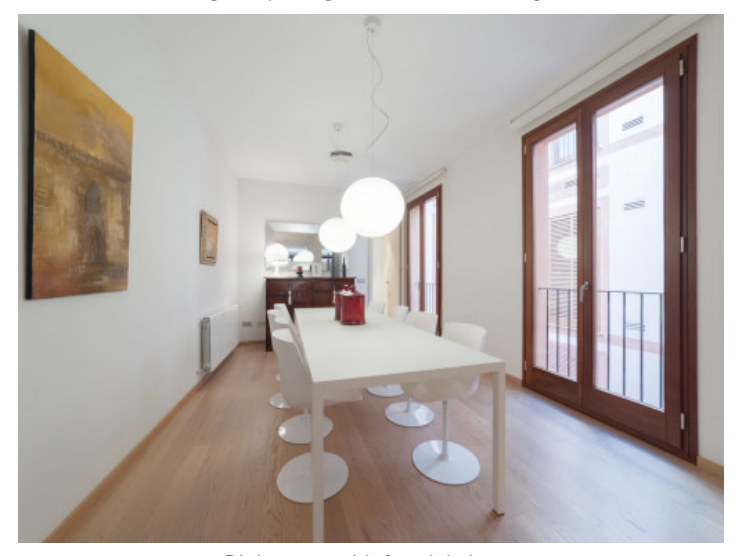
Dining area with french balcony