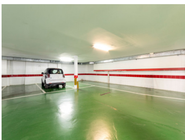
Underground parking space