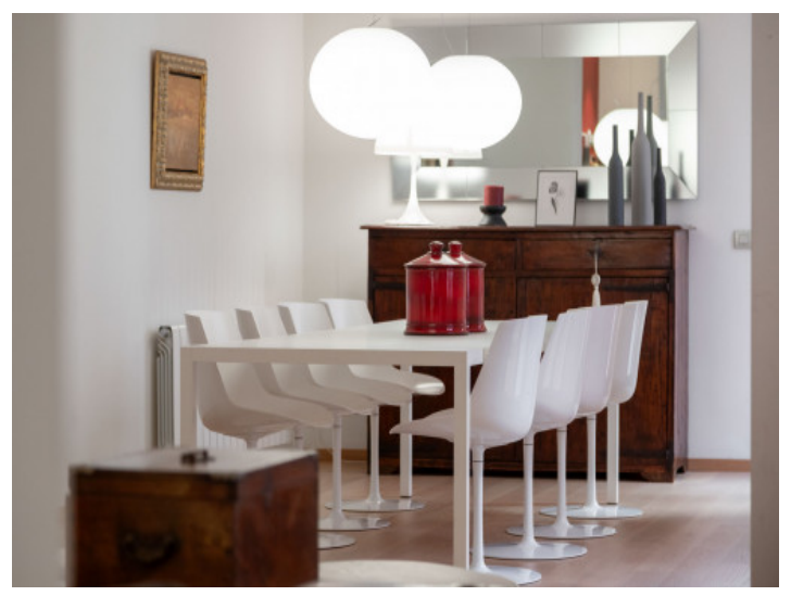
Tasteful dining area