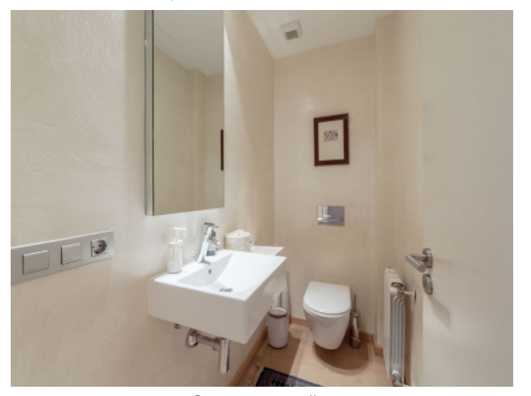
Seperate guest toilet

All information is correct to the best of our knowledge. Errors and prior sale excepted. This prospectus is purely for information purposes. Only the notarized deed of sale is legally binding.