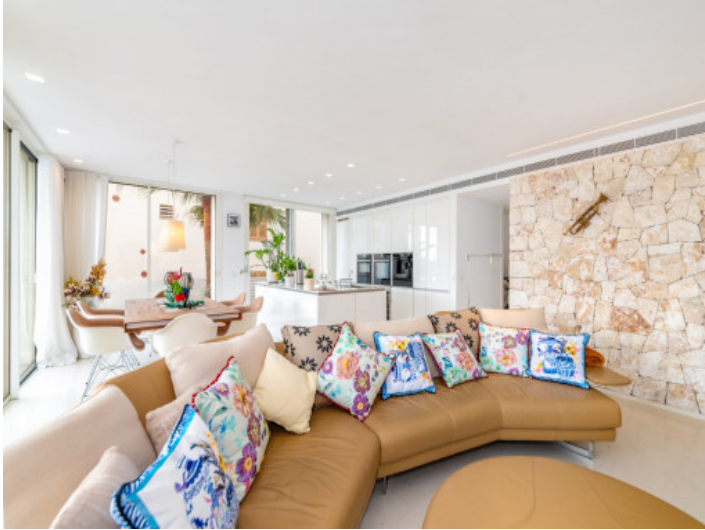
Natural stone wall give the apartment the mediterranean touch