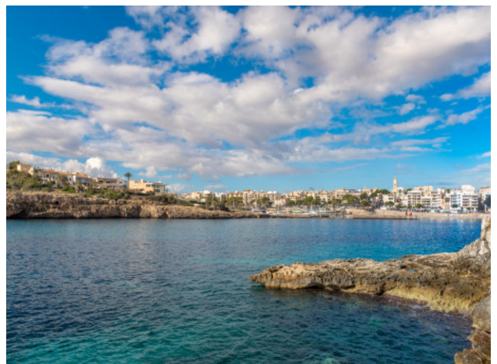
Porto Cristo harbour and beach

All information is correct to the best of our knowledge. Errors and prior sale excepted. This prospectus is purely for information purposes. Only the notarized deed of sale is legally binding.