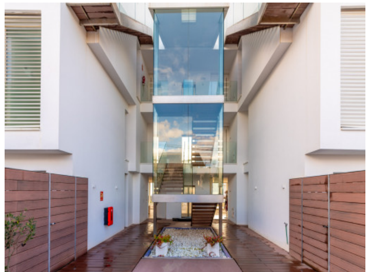
Entrance to the exclusive community