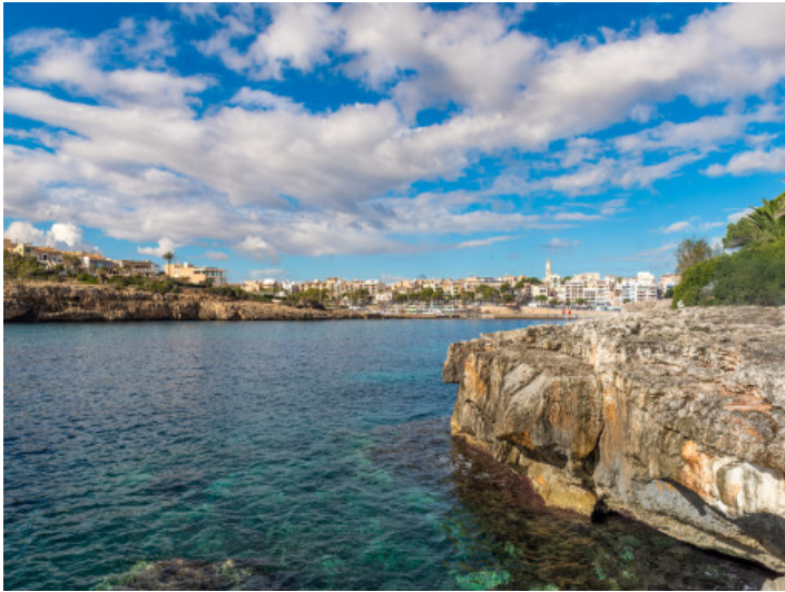
Close to the the harbour of Porto Cristo