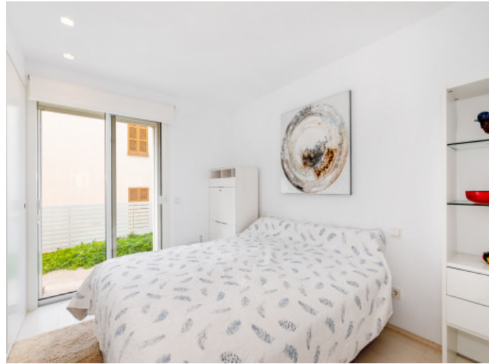
2nd sunny bedroom