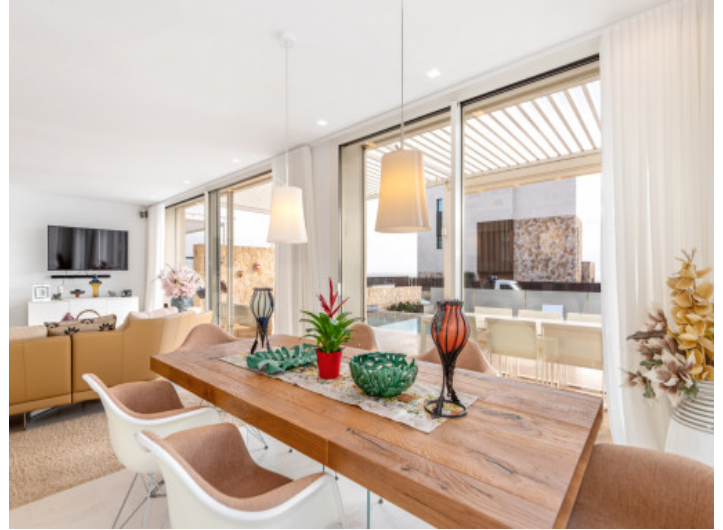
Large dining area