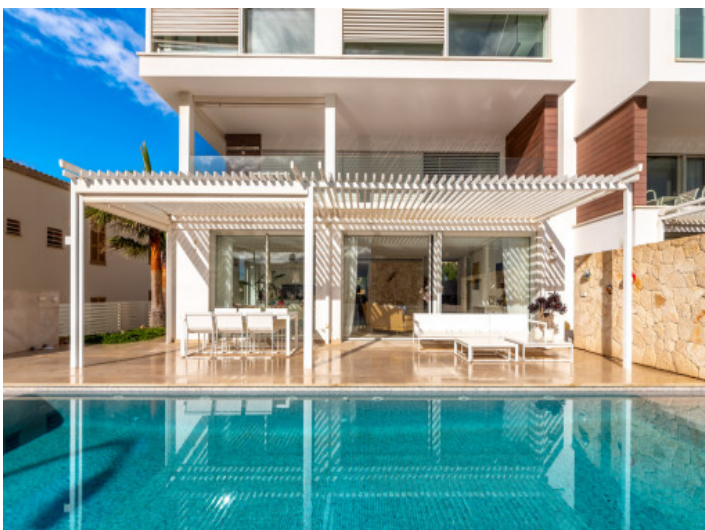
Small community with only 5 units