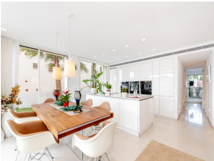
Open plan kitchen