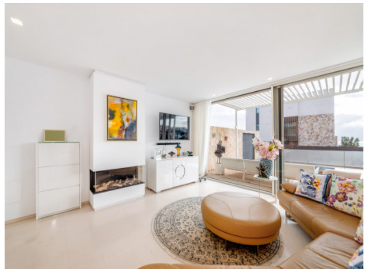
Integrates gas fireplace

All information is correct to the best of our knowledge. Errors and prior sale excepted. This prospectus is purely for information purposes. Only the notarized deed of sale is legally binding.