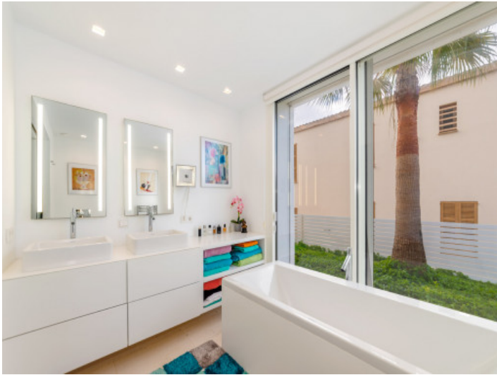
Double washbasin and bathtub