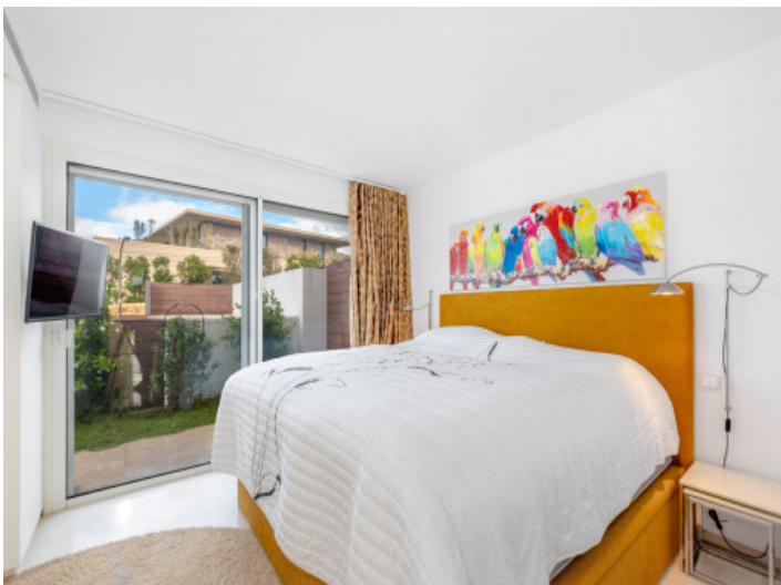
Large bedroom with bath en suite