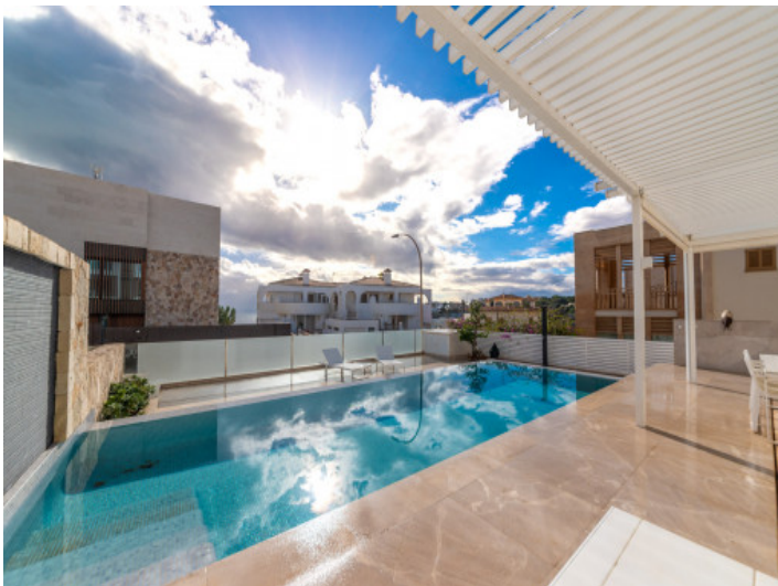
Porch with veranda with views