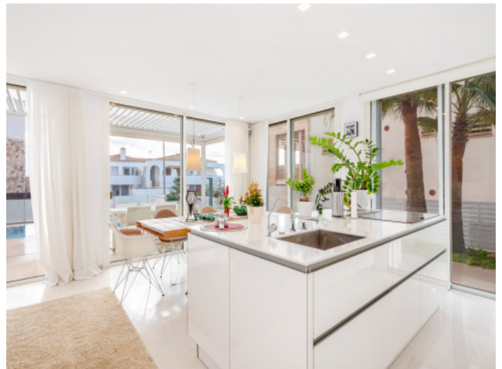
Comfortable kitchen island