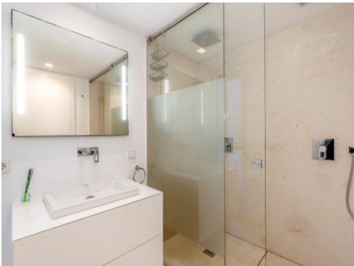
Modern bathroom with shower