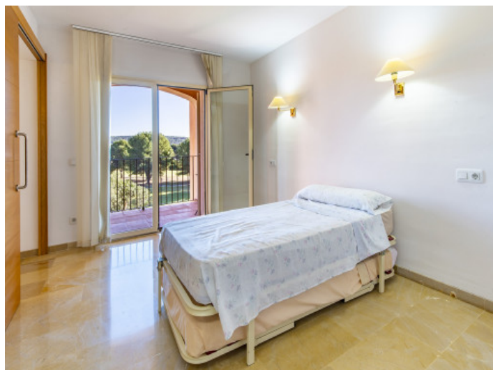
Bedroom with balcony access

All information is correct to the best of our knowledge. Errors and prior sale excepted. This prospectus is purely for information purposes. Only the notarized deed of sale is legally binding.