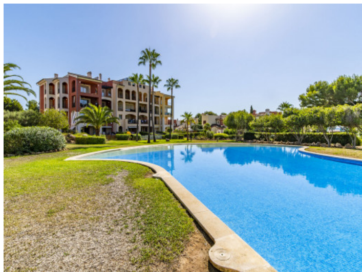
Views from the pool to the building