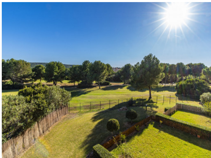
Views to the golf course from the balcony