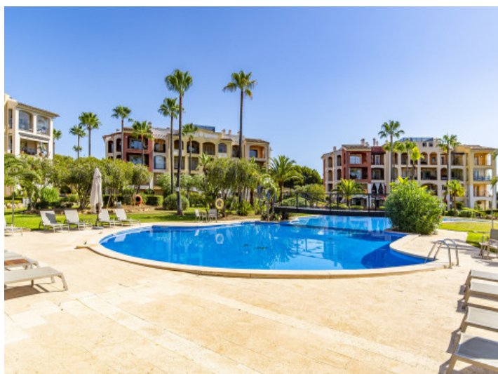
Spacious community pool area