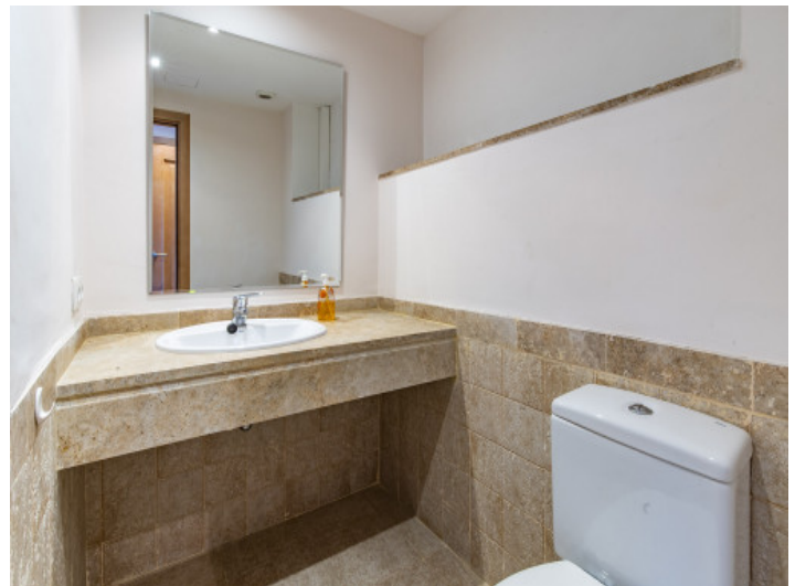
Bathroom for guests