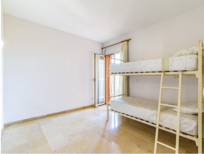
Bedroom with bunk bed