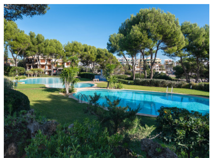
Well maintained communal areas