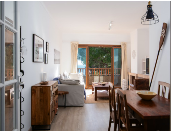
Bright living and dining area