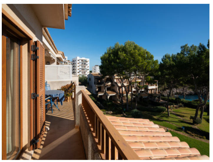
Sunny terrace with sweeping views