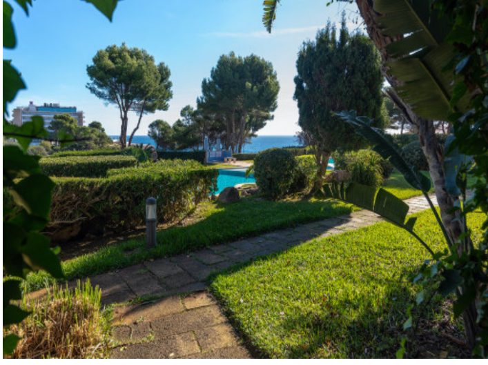
Beautiful communal garden

All information is correct to the best of our knowledge. Errors and prior sale excepted. This prospectus is purely for information purposes. Only the notarized deed of sale is legally binding.