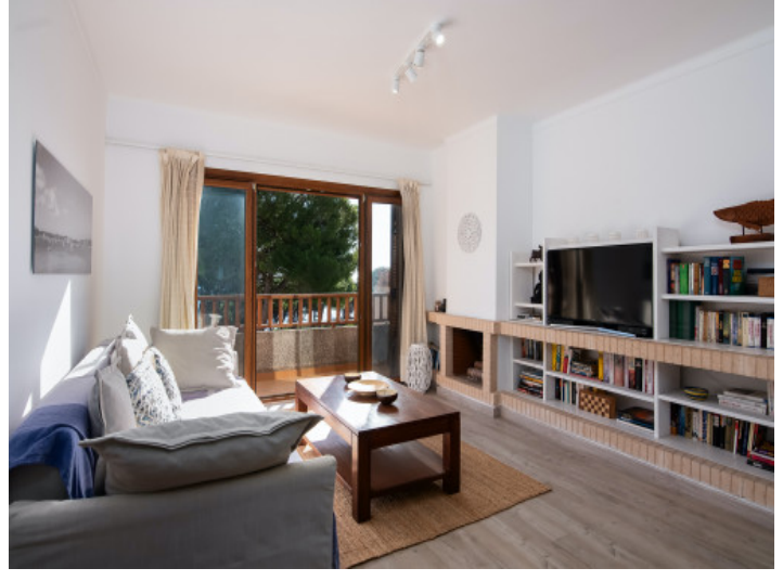
Living area with direct access to the terrace