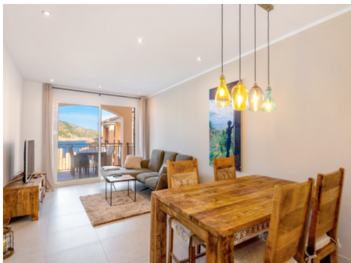
Beautiful living and dining area