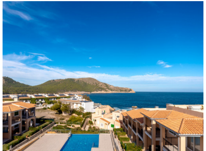
Stunning sea views

All information is correct to the best of our knowledge. Errors and prior sale excepted. This prospectus is purely for information purposes. Only the notarized deed of sale is legally binding.