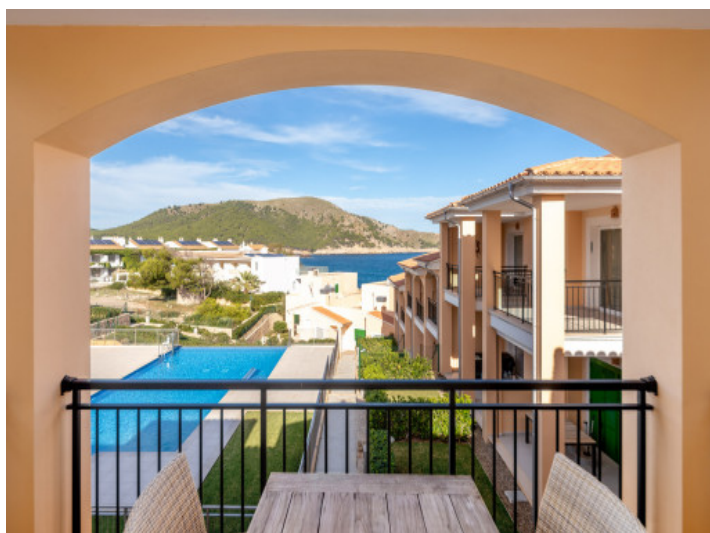
Covered sea view balcony