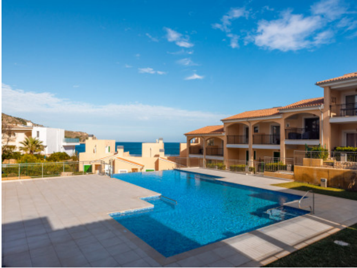
Large communal pool