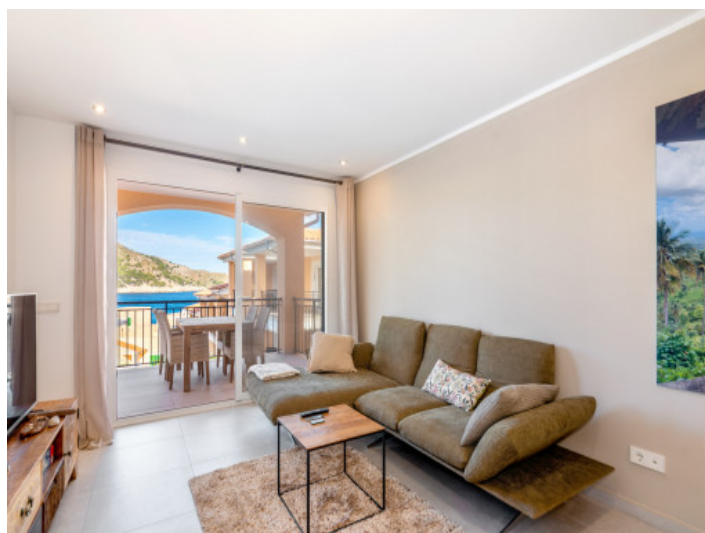
Living area with balcony access