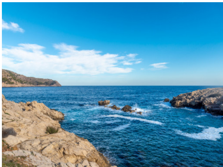
Stunning location in first sea line