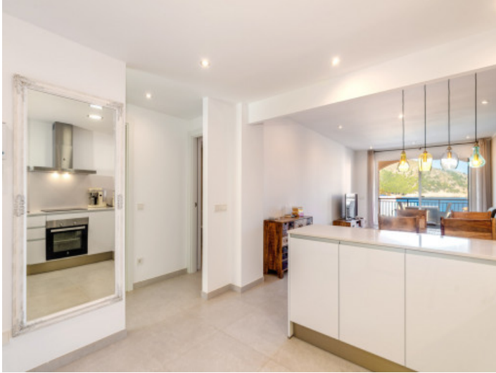
Alternative kitchen view