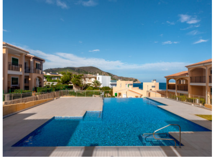
Well-tended pool area