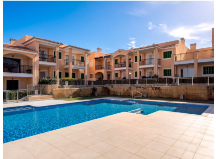
Alternative pool view