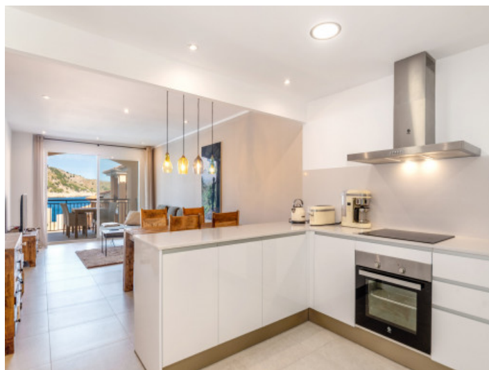
Open, modern kitchen

All information is correct to the best of our knowledge. Errors and prior sale excepted. This prospectus is purely for information purposes. Only the notarized deed of sale is legally binding.