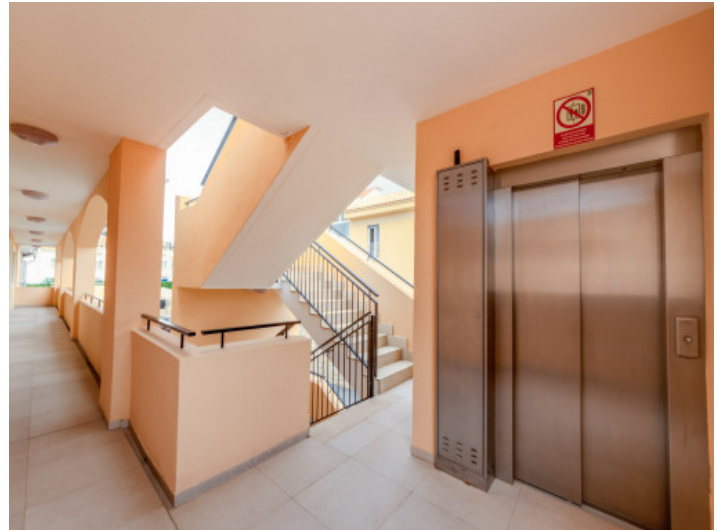
Elevator in the community