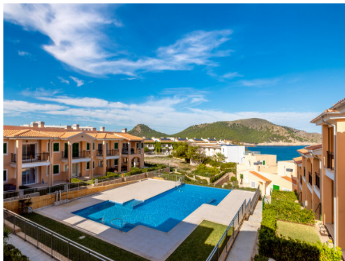
Wonderful complex with communal pool