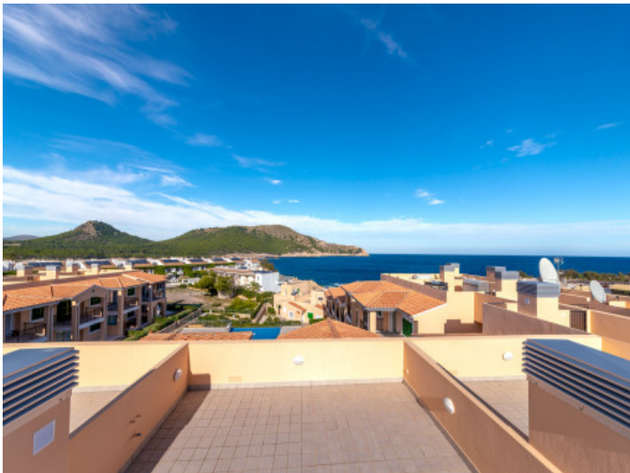
Fantastic roof top terrace