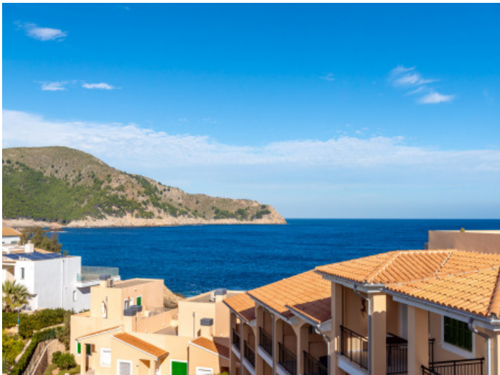
Wonderful sea views