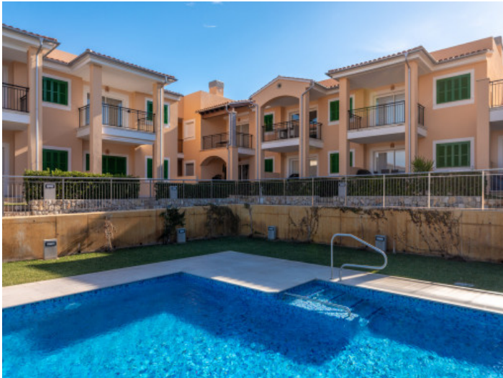
View of the complex with pool