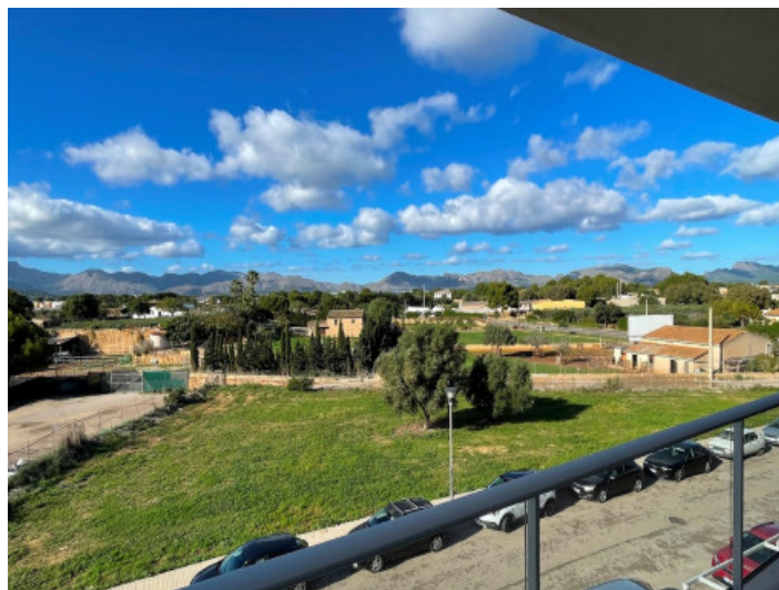
Lovely mountain view