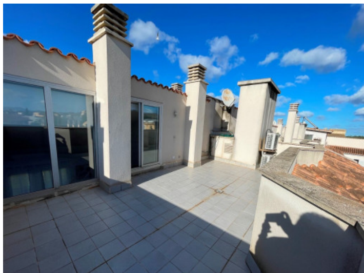
Large roof terrace