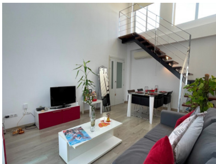
Open plan living and dining area