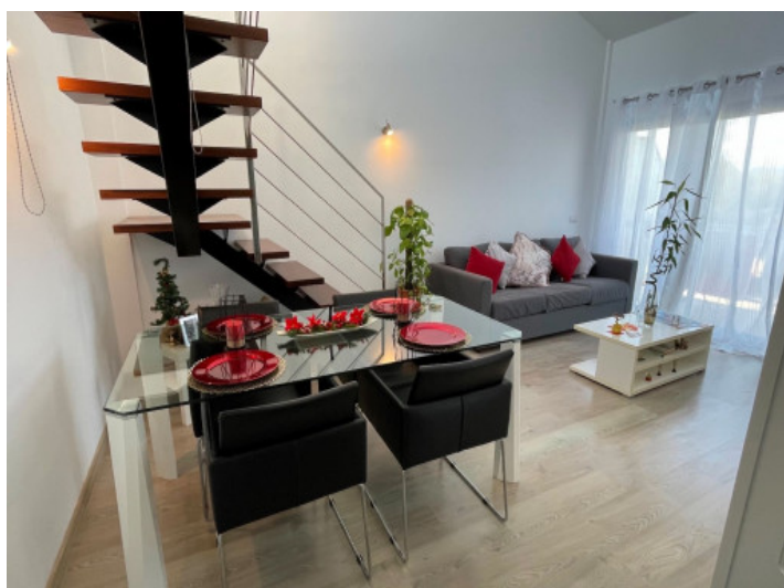
Living and dining area with direct access to the balcony