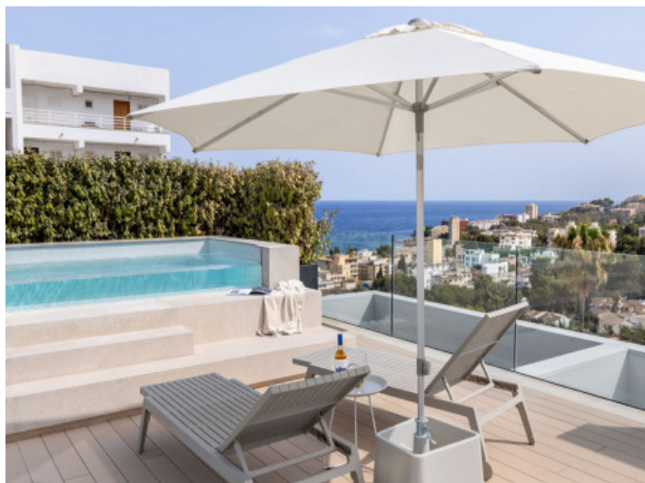
Roof terrace with pool