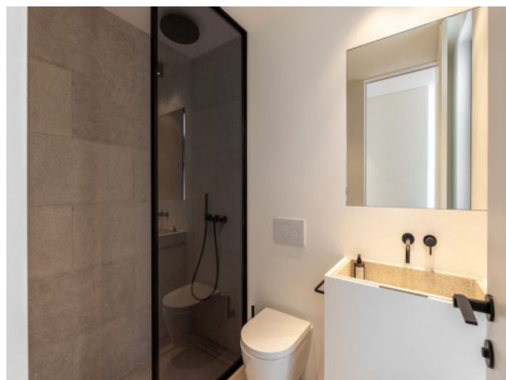
Bathroom with shower