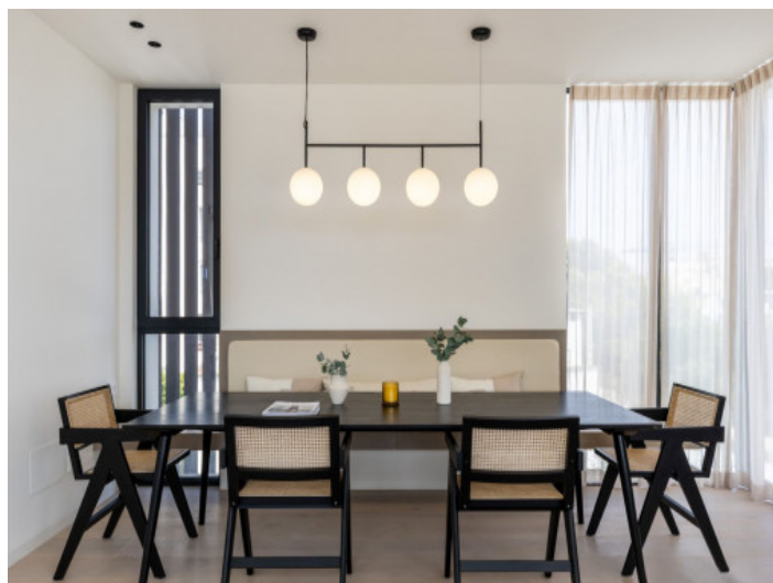
Modern dining area

All information is correct to the best of our knowledge. Errors and prior sale excepted. This prospectus is purely for information purposes. Only the notarized deed of sale is legally binding.