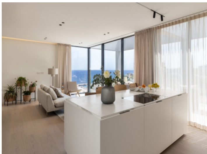
Open kitchen with cooking island