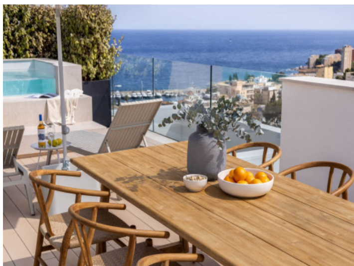
Spacious roof terrace