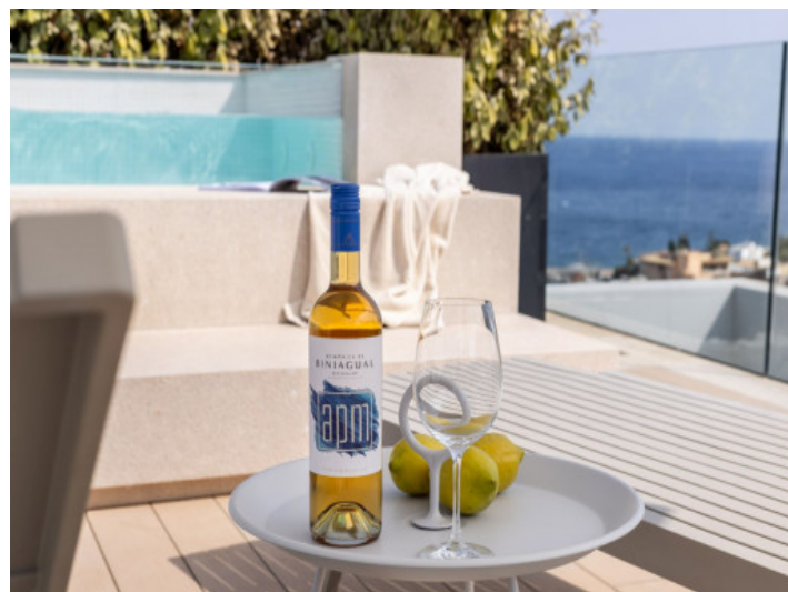
Mediterranean sea views from the balcony

All information is correct to the best of our knowledge. Errors and prior sale excepted. This prospectus is purely for information purposes. Only the notarized deed of sale is legally binding.