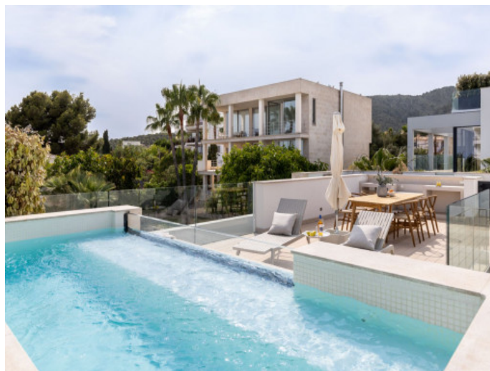
New construction duplex penthouse with private roof terrace, pool and