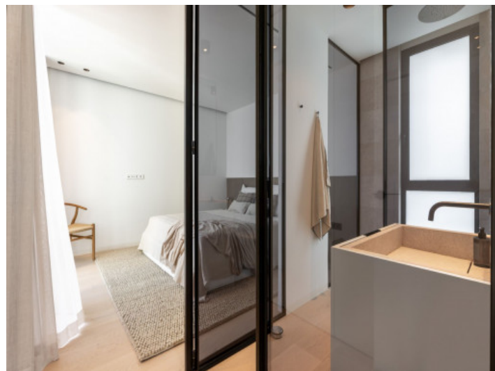
Bathroom with daylight