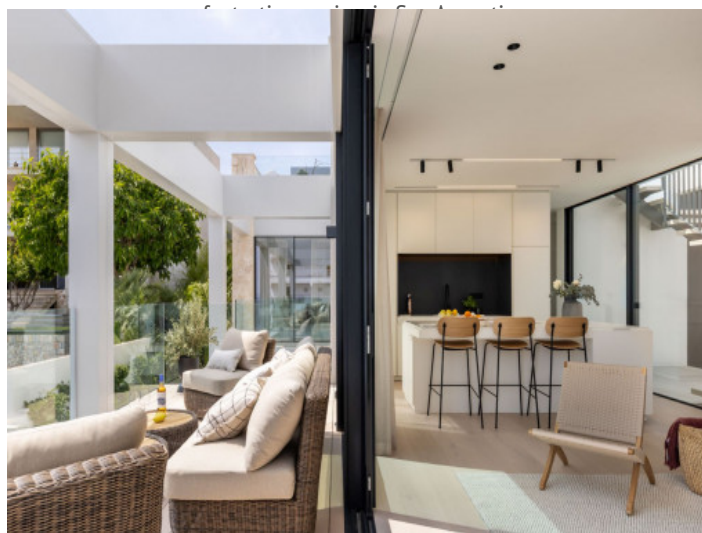
Living area with balcony access