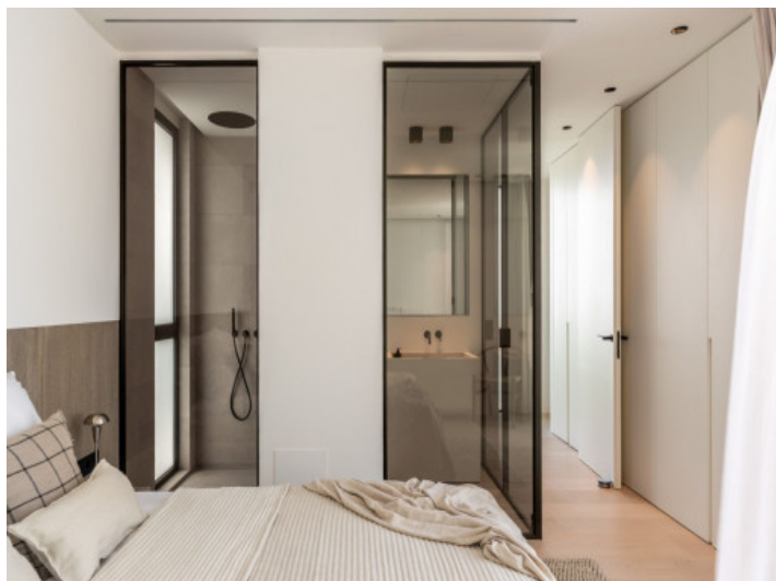
Elegant bedroom with bathroom en suite