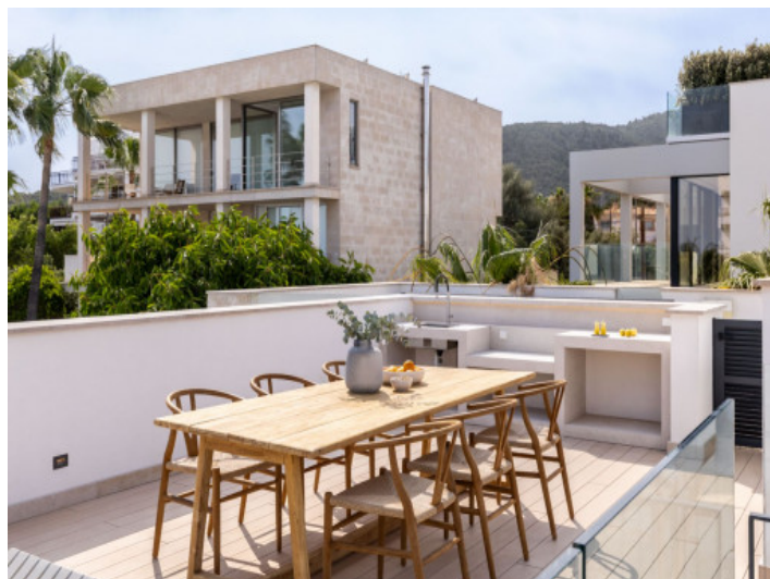
Modern roof terrace