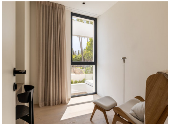
Office from the penthouse

All information is correct to the best of our knowledge. Errors and prior sale excepted. This prospectus is purely for information purposes. Only the notarized deed of sale is legally binding.