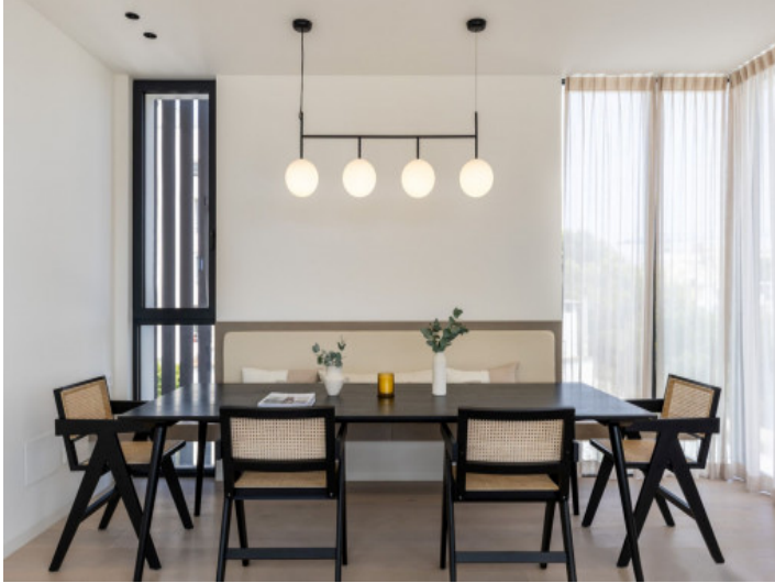
Dining area from the penthouse