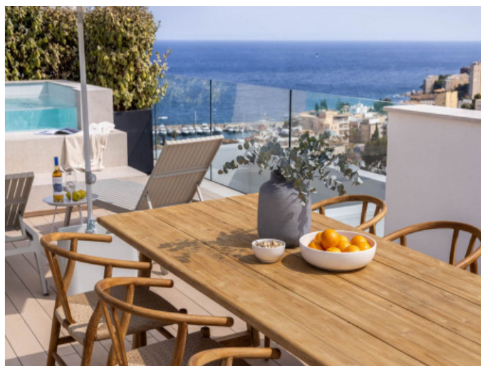
Roof terrace with sea views