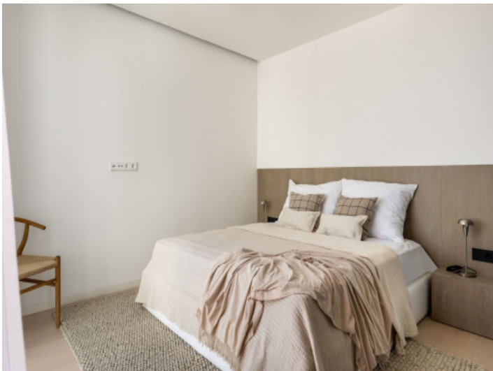
Bedroom with double bed