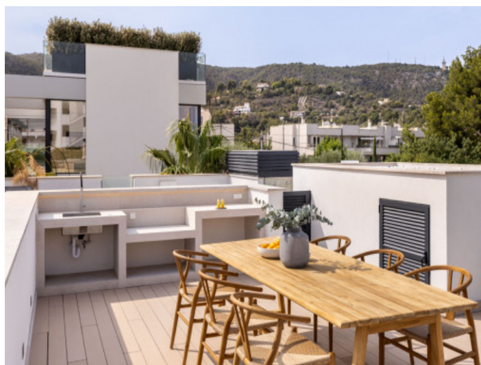
Spacious roof terrace