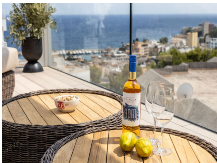
Mediterranean sea views from the balcony