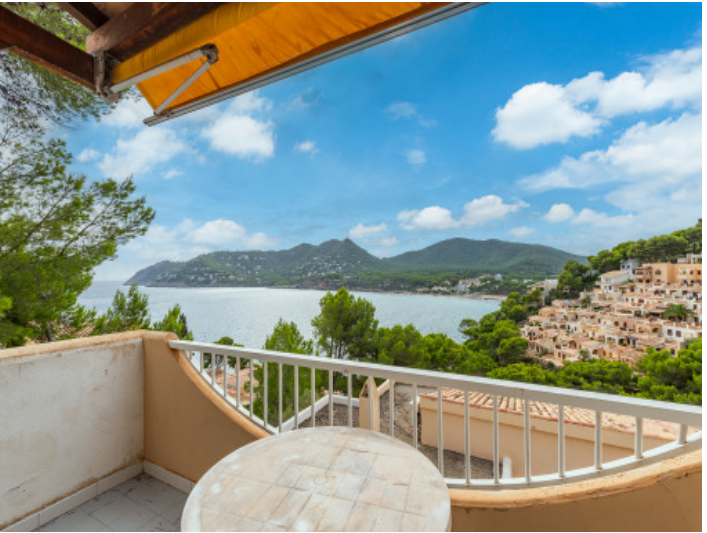
Views from the balcony to the mountains