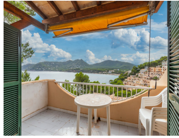
Balcony with mediterran sea views

PORTA MALLORQUINA® Your home. Our passion.