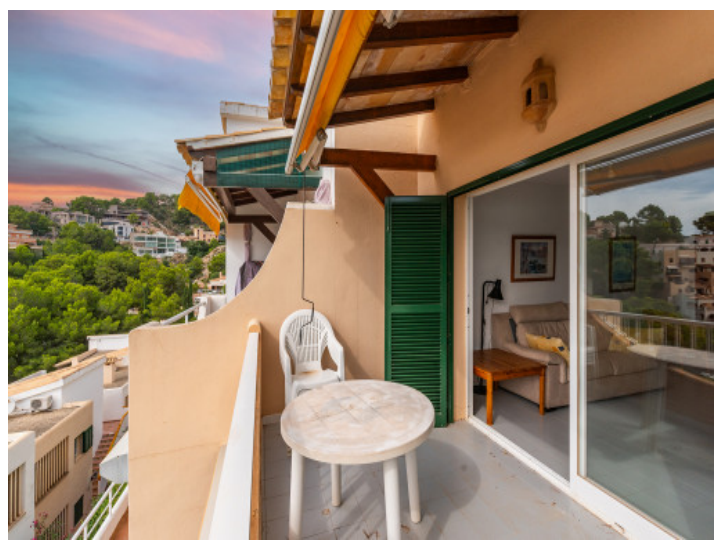
Views to the surroundings from the balcony