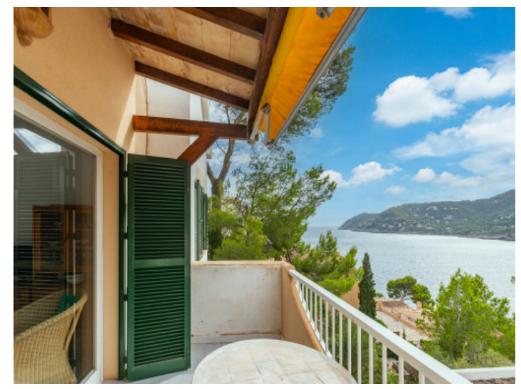
Balcony with awning