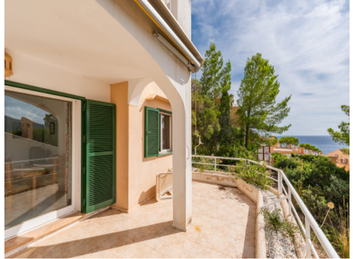
Terrace with sea views