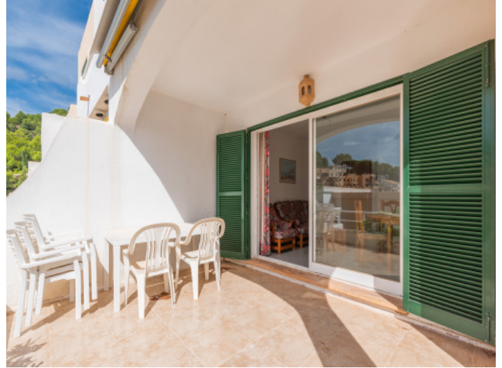
Large covered terrace