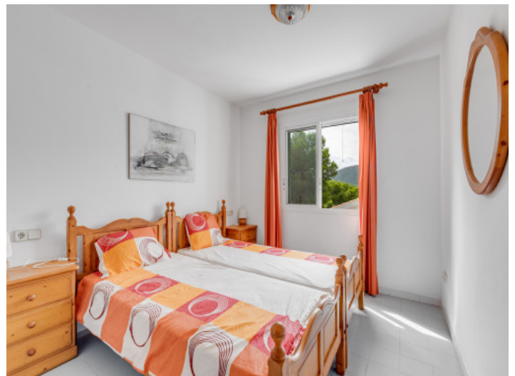
Second double bedroom

All information is correct to the best of our knowledge. Errors and prior sale excepted. This prospectus is purely for information purposes. Only the notarized deed of sale is legally binding.