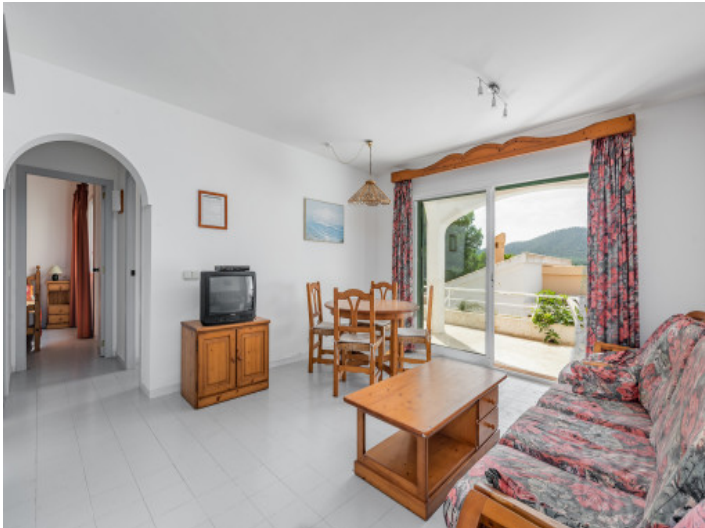
Living area with terrace access