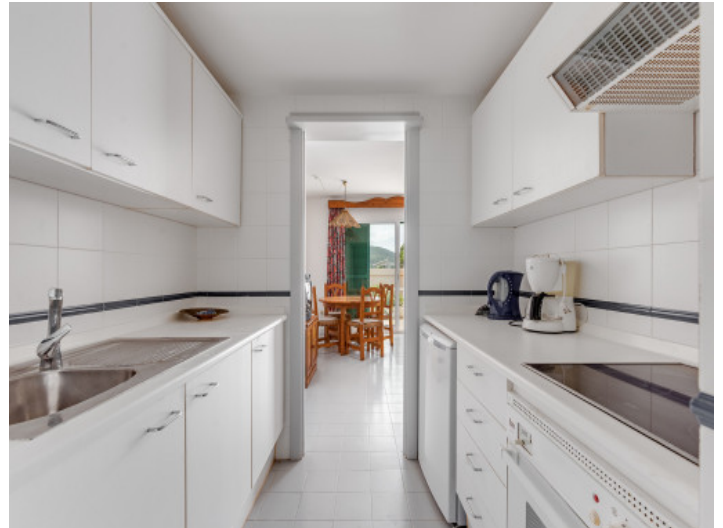
Fully fitted kitchen