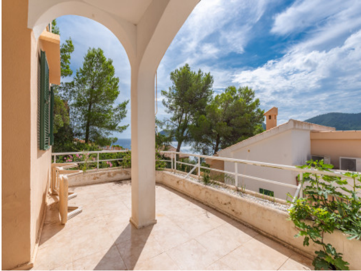
Sea view apartment with terrace in Canyamel