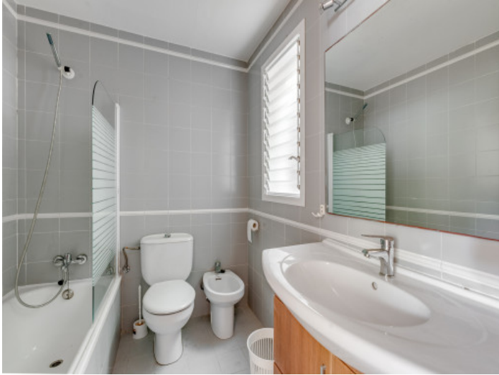
One of 2 bathrooms