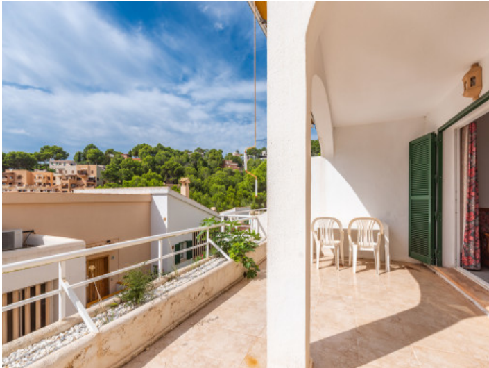
Alternative terrace view