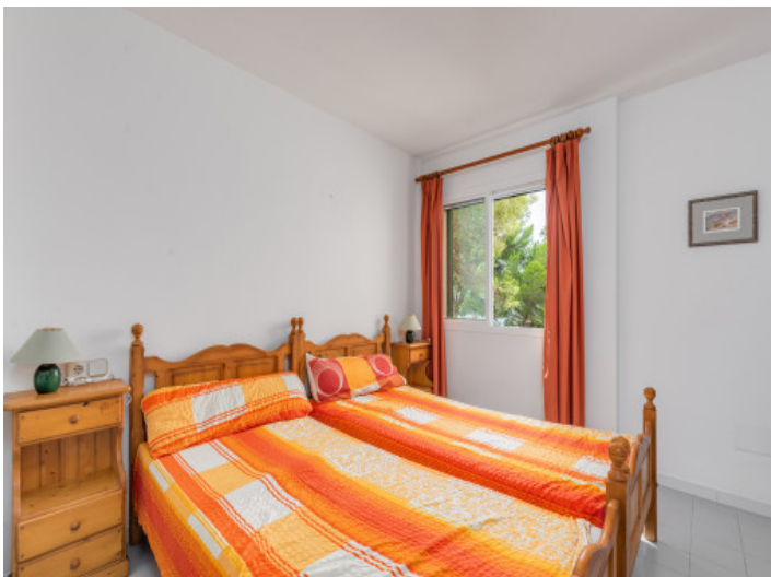
Bright double bedroom