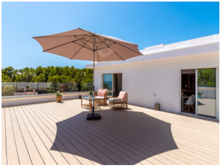
Large 80 sqm roof terrace