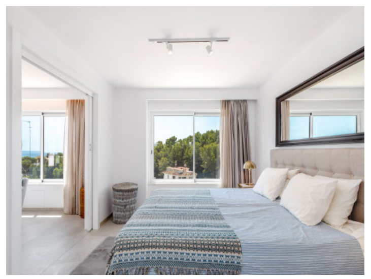
Beautiful double bedroom