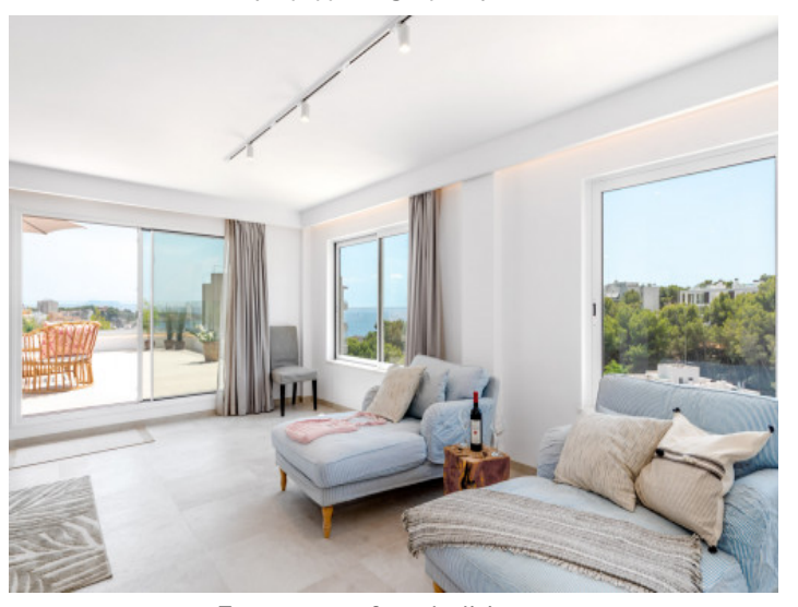
Terrace access from the living area

All information is correct to the best of our knowledge. Errors and prior sale excepted. This prospectus is purely for information purposes. Only the notarized deed of sale is legally binding.