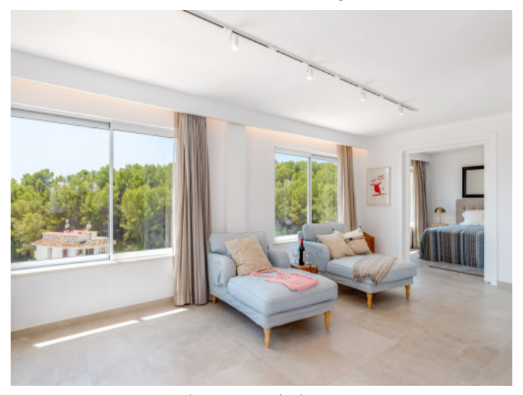
Access to one bedroom