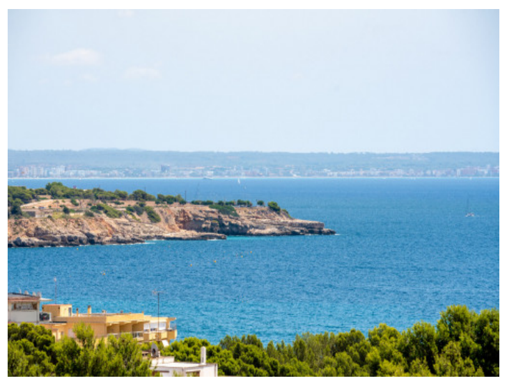
Beautiful sea views