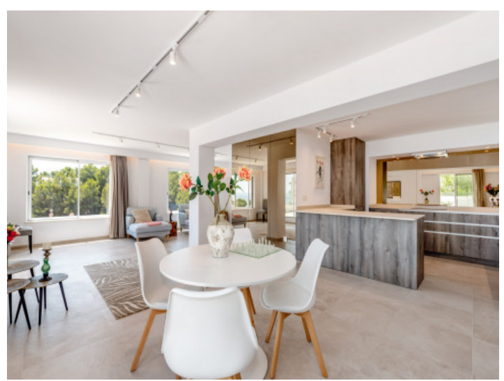
Modern, open-plan living area