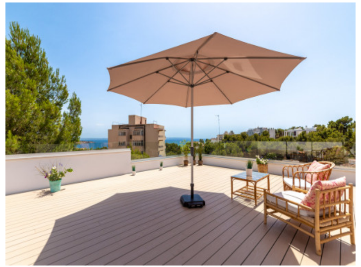
Fantastic views to the sea