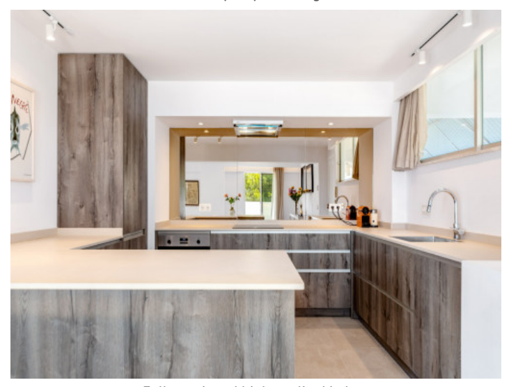
Fully equipped high quality kitchen