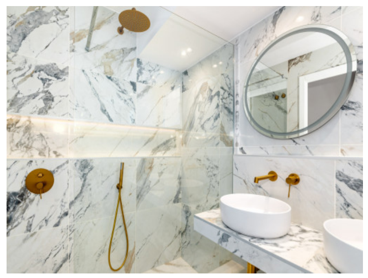
Elegant shower bathroom