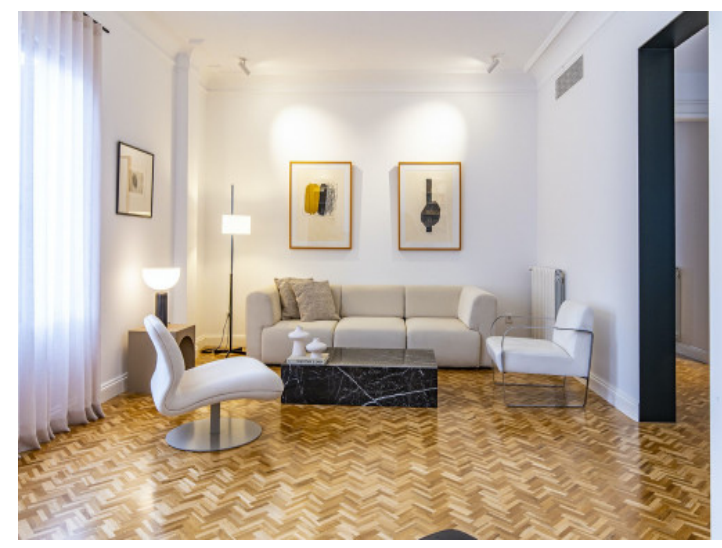
Fantastic living area

PORTA MALLORQUINA® Your home. Our passion.