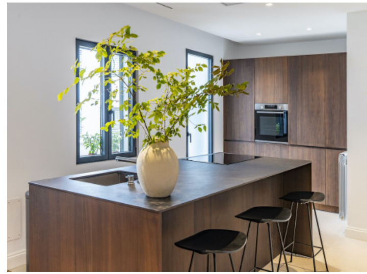
Fully equipped kitchen One of 3 bedrooms All information is correct to the best of our knowledge. Errors and prior sale excepted. This prospectus is purely for information purposes. Only the notarized deed of sale is legally binding.

PORTA MALLORQUINA • C./ CONQUISTADOR 8, 07001 PALMA TEL. +34 971 698 242 • INFO@PORTAMALLORQUINA.COM