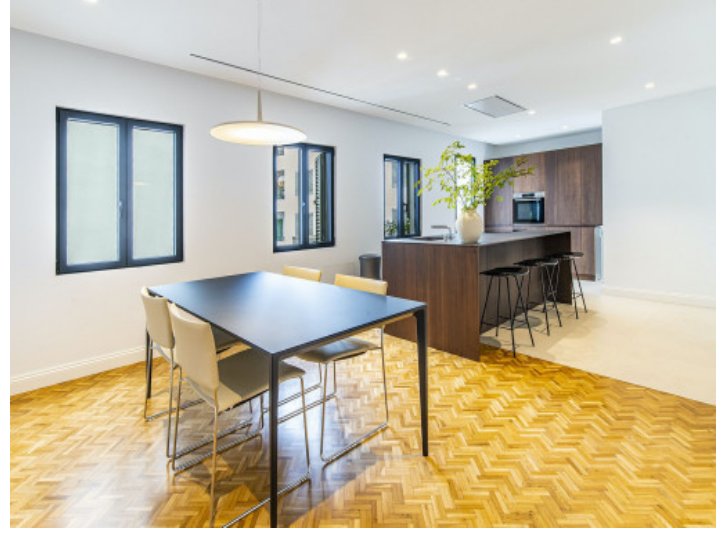
Modern kitchen and dining area