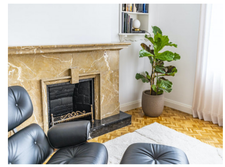
Living area with fireplace