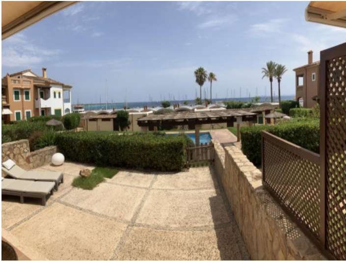
Terrace with pool access