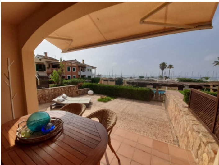
Alternative terrace view