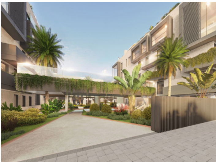
Access to the complex