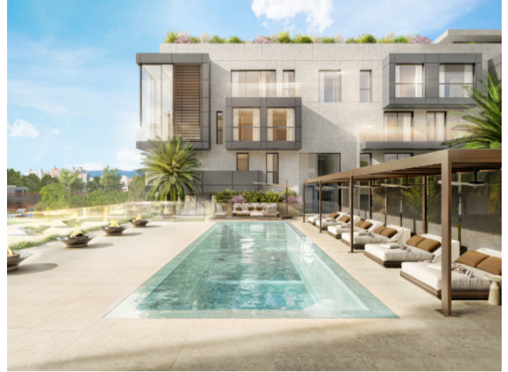
Fantastic pool area