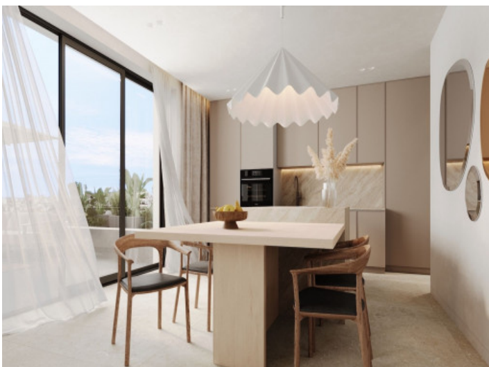
Kitchen and dining area