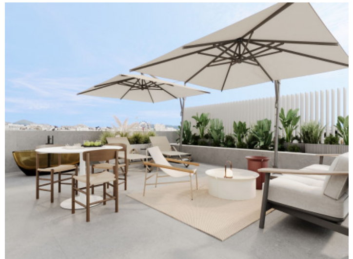
Spacious roof terrace