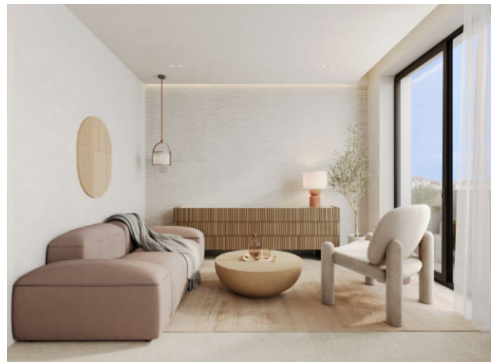
Light-flooded living area

All information is correct to the best of our knowledge. Errors and prior sale excepted. This prospectus is purely for information purposes. Only the notarized deed of sale is legally binding.