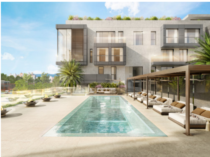
Alternative view of the pool