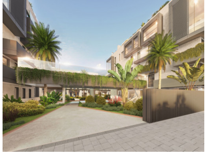
Access to the complex