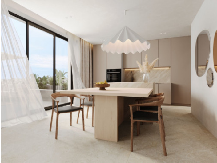
Modern kitchen and dining area