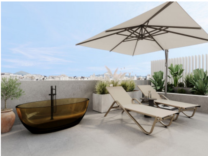
Roof terrace with bathtub