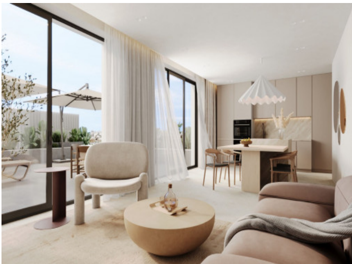
Cosy living area