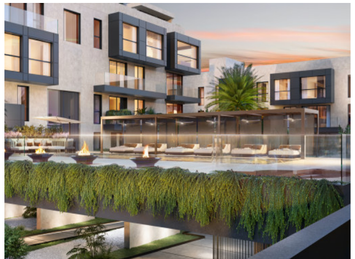
Alternative view of the complex

All information is correct to the best of our knowledge. Errors and prior sale excepted. This prospectus is purely for information purposes. Only the notarized deed of sale is legally binding.