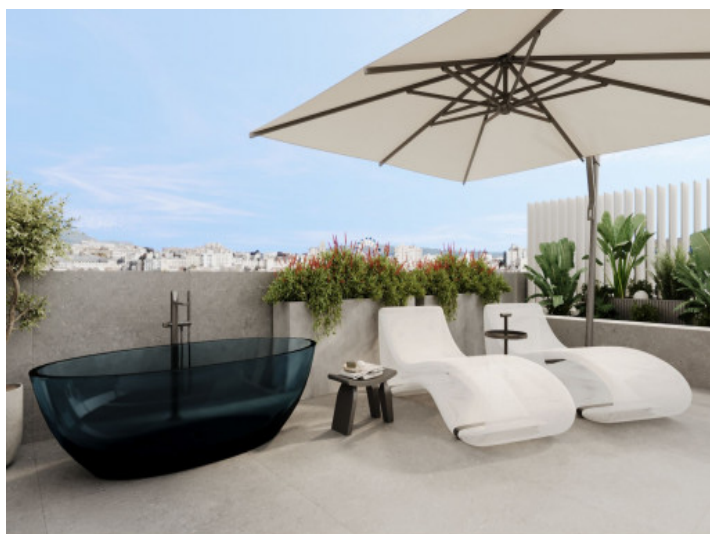
Terrace with bathtub