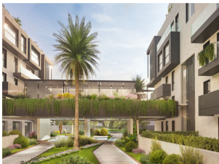
Beautifully planted communal area

All information is correct to the best of our knowledge. Errors and prior sale excepted. This prospectus is purely for information purposes. Only the notarized deed of sale is legally binding.