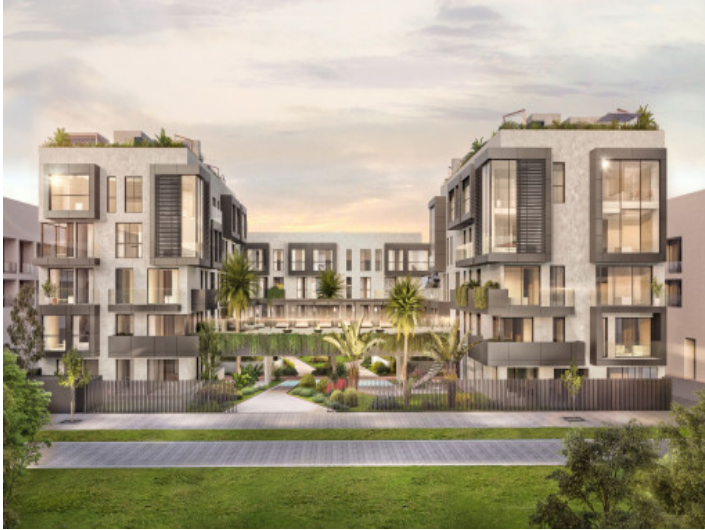
New luxury apartment with park area in Nou Llevant