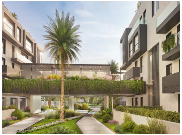
Beautifully planted communal area