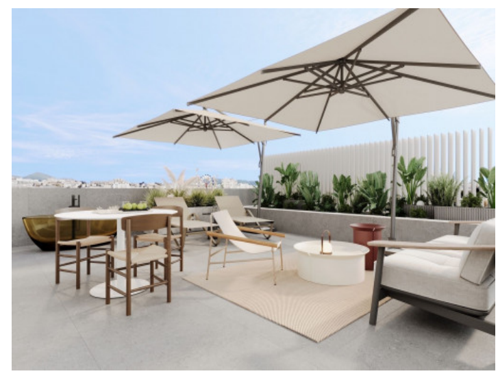
Roof terrace with luxurious lounge area