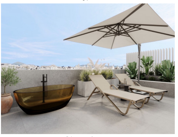
Private roof terrace