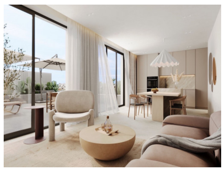
Living and dining area with access to a terrace