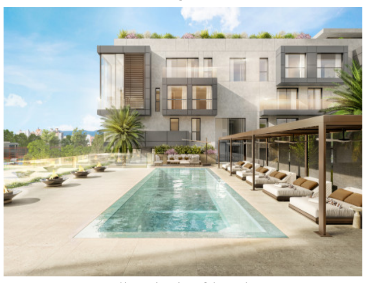
Alternative view of the pool

All information is correct to the best of our knowledge. Errors and prior sale excepted. This prospectus is purely for information purposes. Only the notarized deed of sale is legally binding.