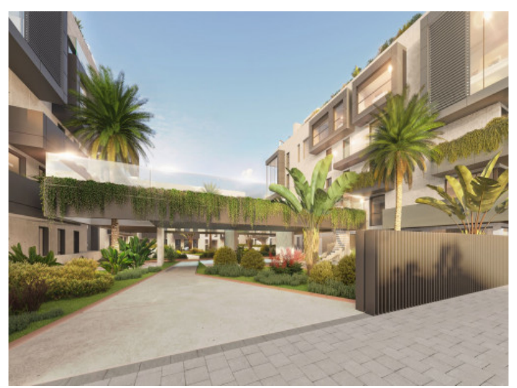
Access to the complex