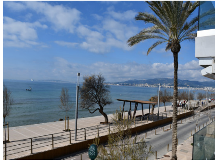
Direct sea access