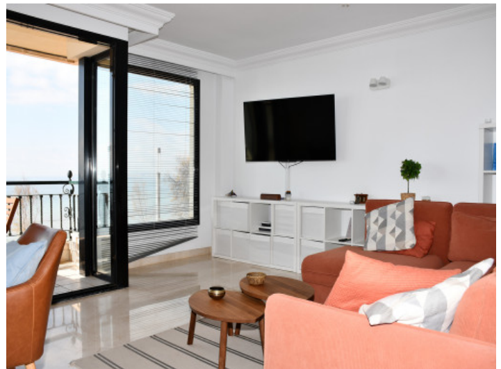
Lounge alternate view