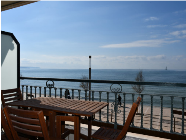
Terrasse mit Meerblick