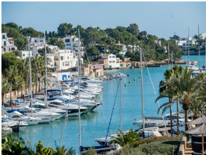
Gorgeous sea and harbour views