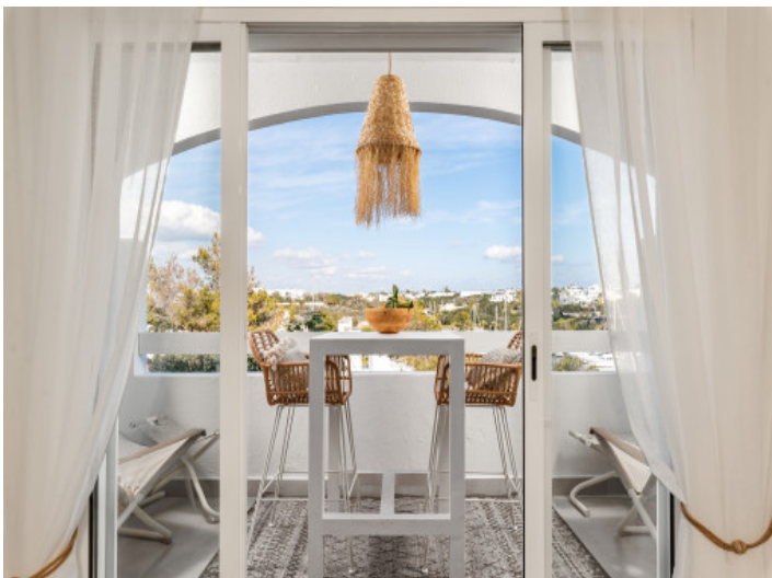
Access to the balcony