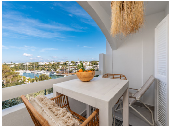
Balcony with fantastic harbour views