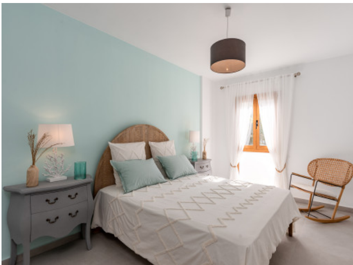
Bright double bedroom