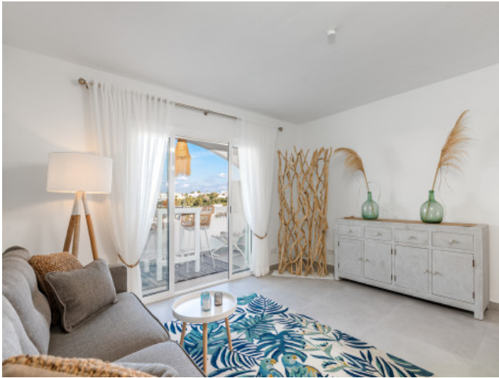
Tastefully renovated apartment