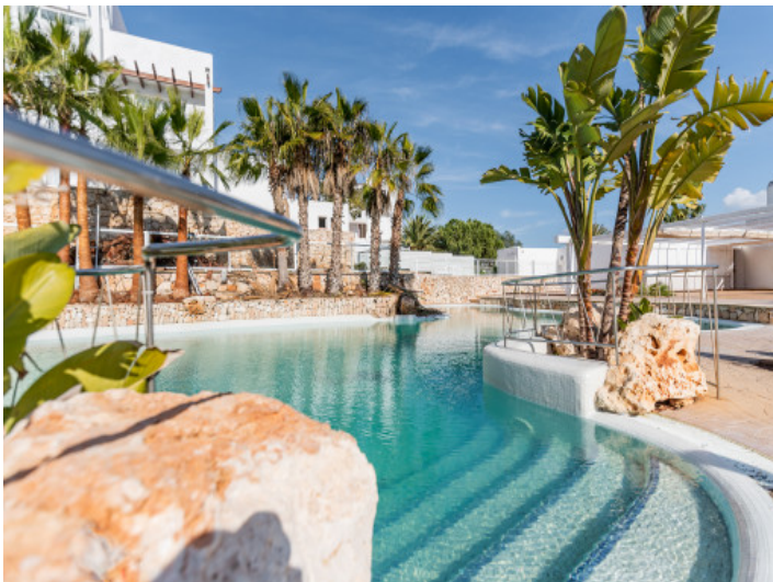
Beautifully laid-out communal pool