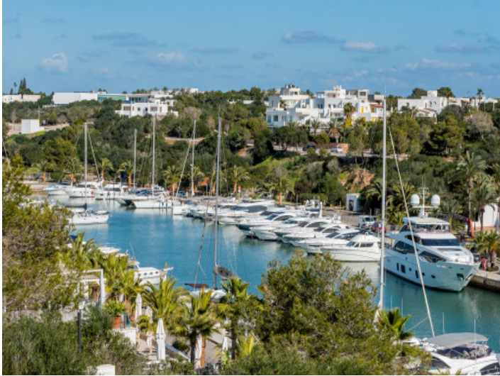
Impressive harbour views