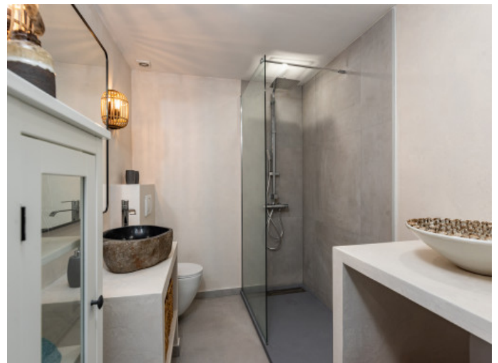
Renovated shower bathroom

All information is correct to the best of our knowledge. Errors and prior sale excepted. This prospectus is purely for information purposes. Only the notarized deed of sale is legally binding.