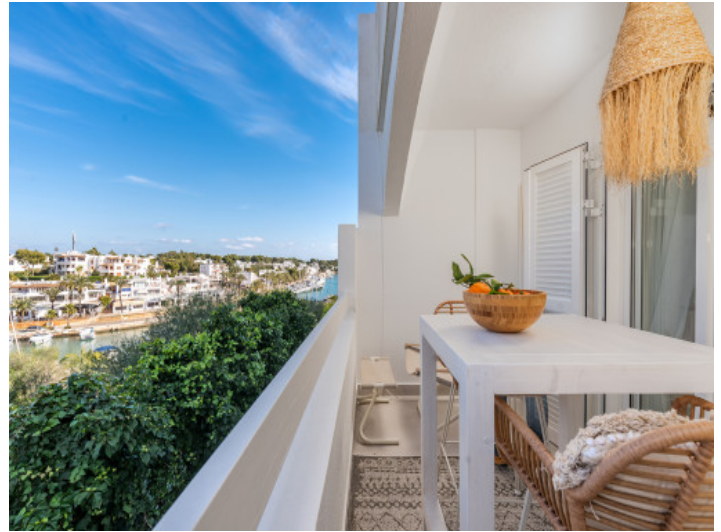
Balcony with sea views