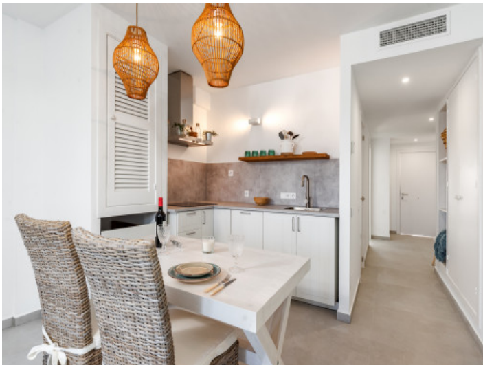
Open dining area and kitchen