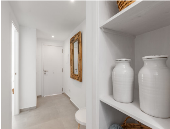
Pleasant entrance area