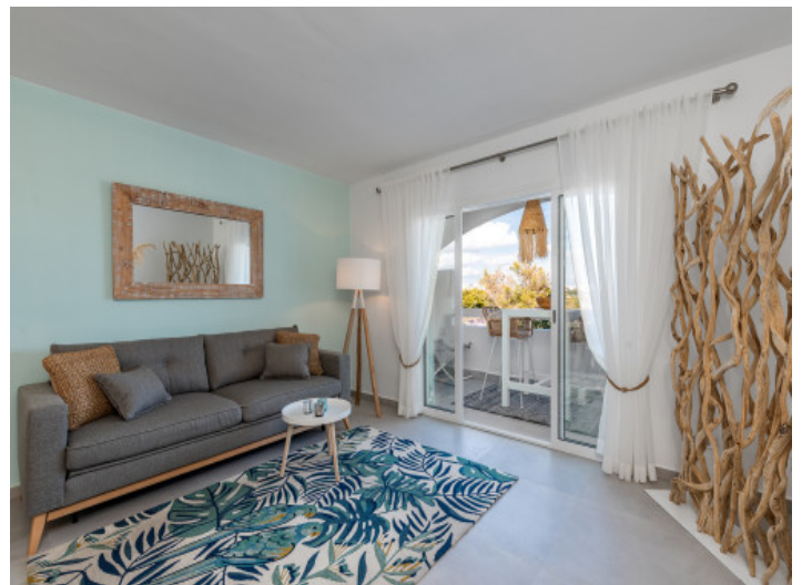
Comfortable living area

All information is correct to the best of our knowledge. Errors and prior sale excepted. This prospectus is purely for information purposes. Only the notarized deed of sale is legally binding.