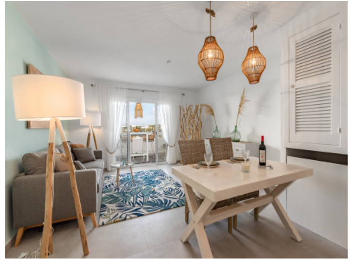
Living area with feel-well ambience