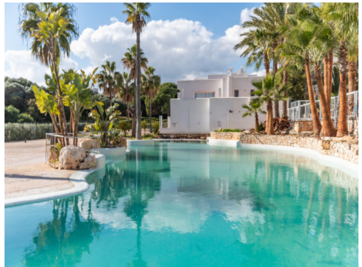
Inviting communal pool