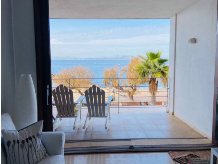
Balcony with sea views