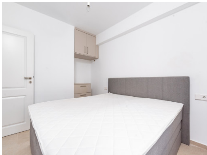
Alternative view of the bedroom