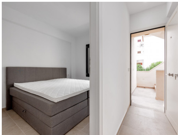
Bedroom and floor