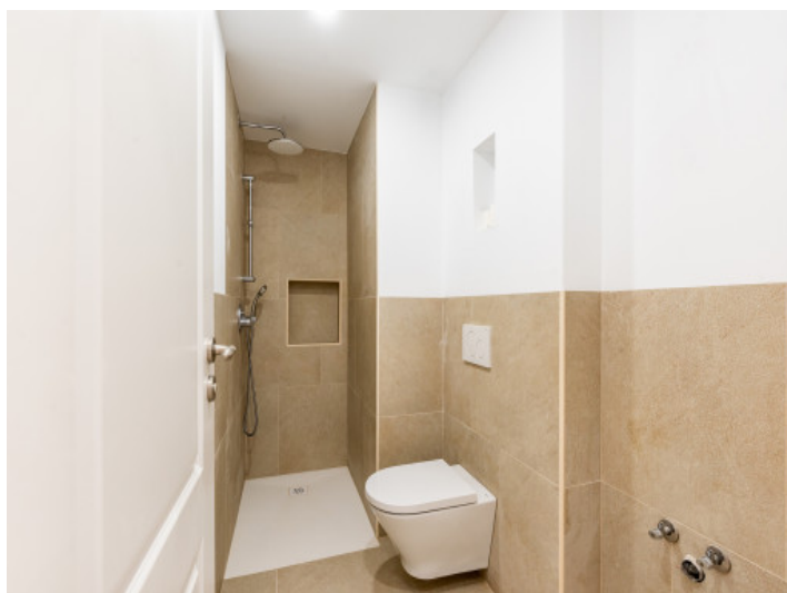
Noble bathroom with walk-in shower