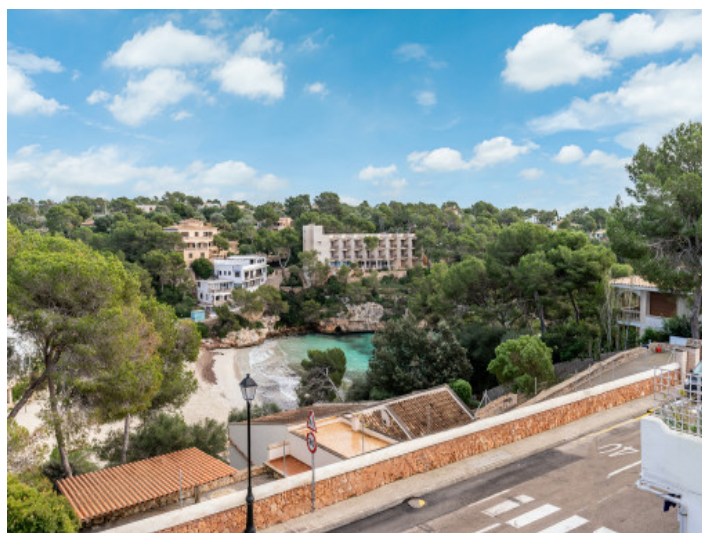
View to the bay Cala Santanyi