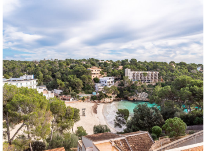
Apartment with views to the bay Cala Santanyi