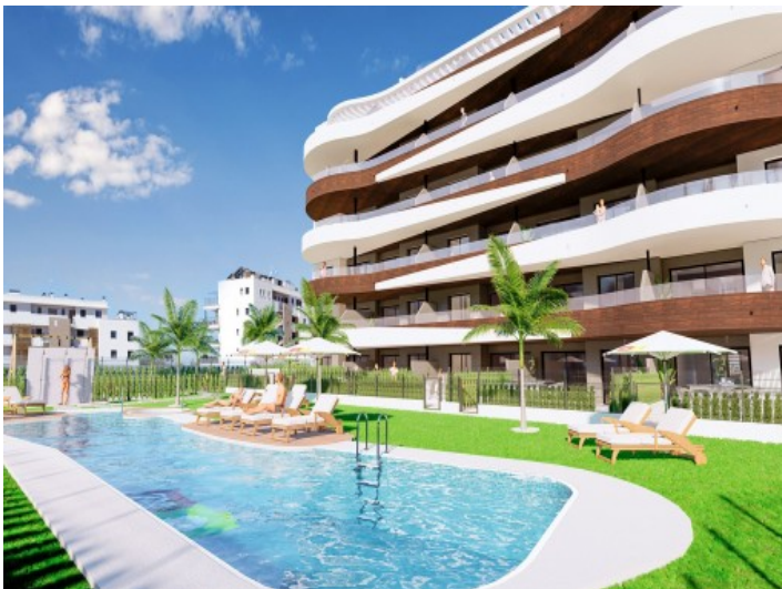
Complejo y piscina