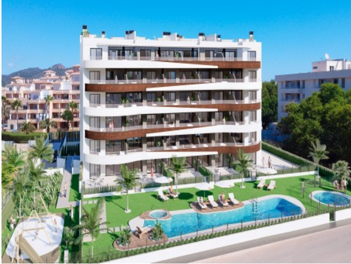
Complejo y piscina