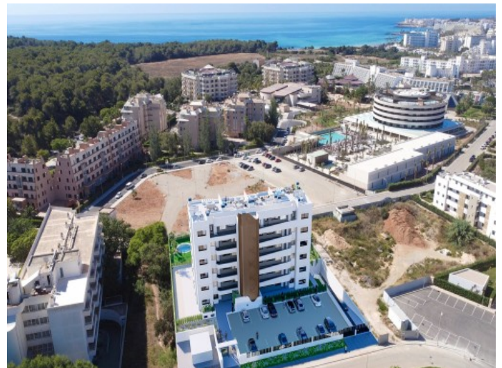
Vista desde arriba

All information is correct to the best of our knowledge. Errors and prior sale excepted. This prospectus is purely for information purposes. Only the notarized deed of sale is legally binding.