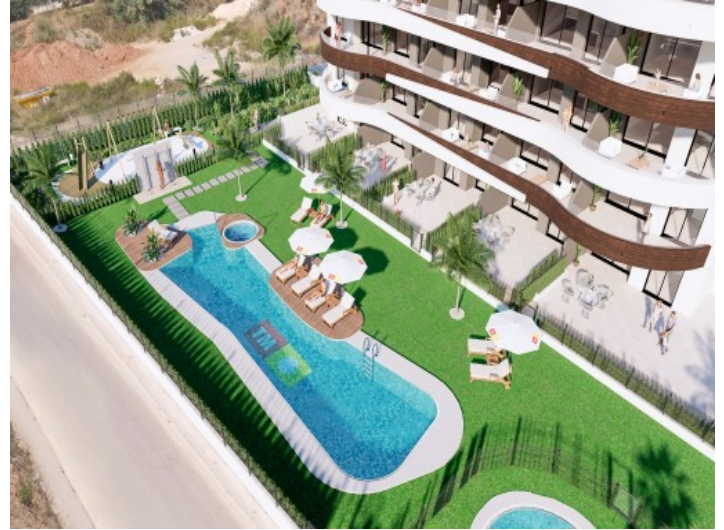
Complejo y piscina