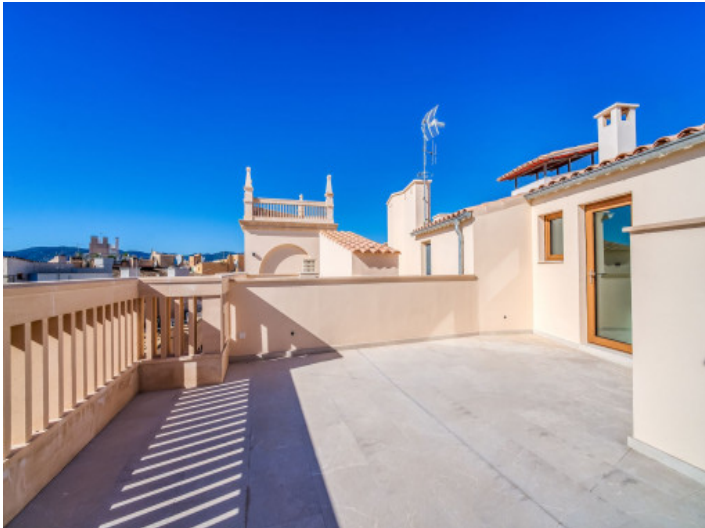
Splendid penthouse with roof terrace in Palma