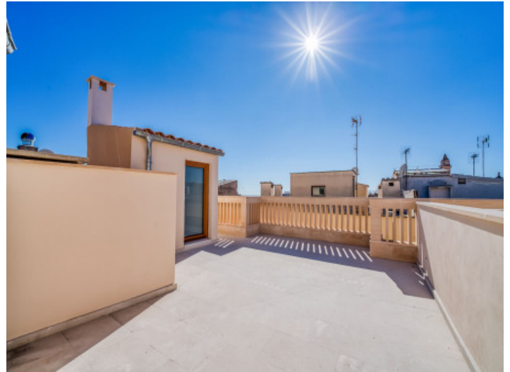
Sunny roof top terrace

All information is correct to the best of our knowledge. Errors and prior sale excepted. This prospectus is purely for information purposes. Only the notarized deed of sale is legally binding.