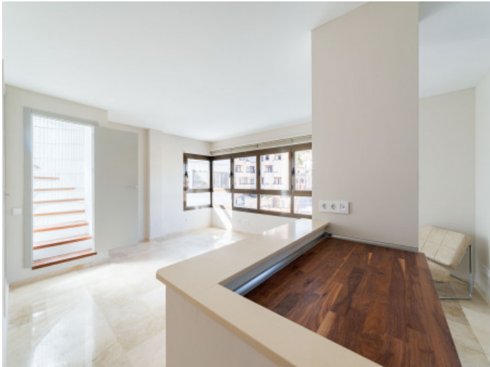
Living area and kitchen