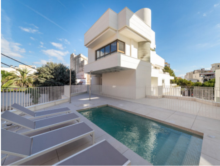
Community pool area