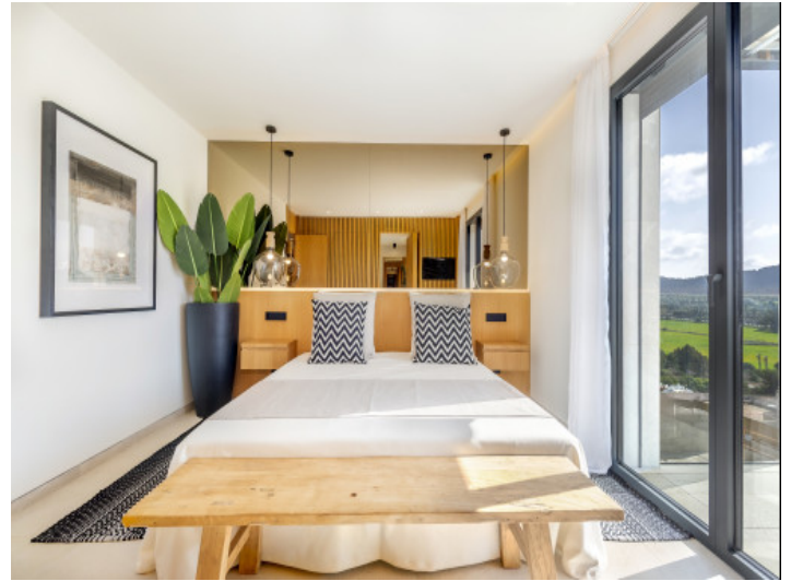
Eines von 4 Schlafzimmer