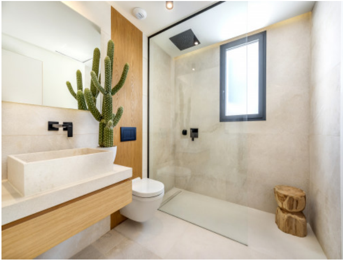
Badezimmer 2 Grup Vial