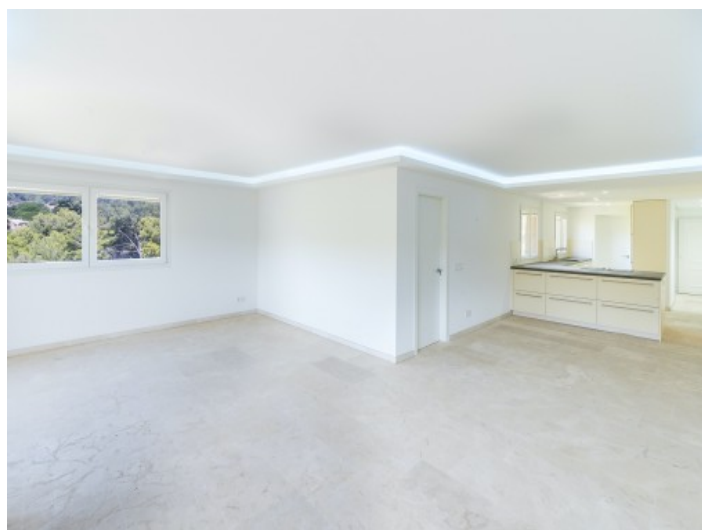
View to the kitchen