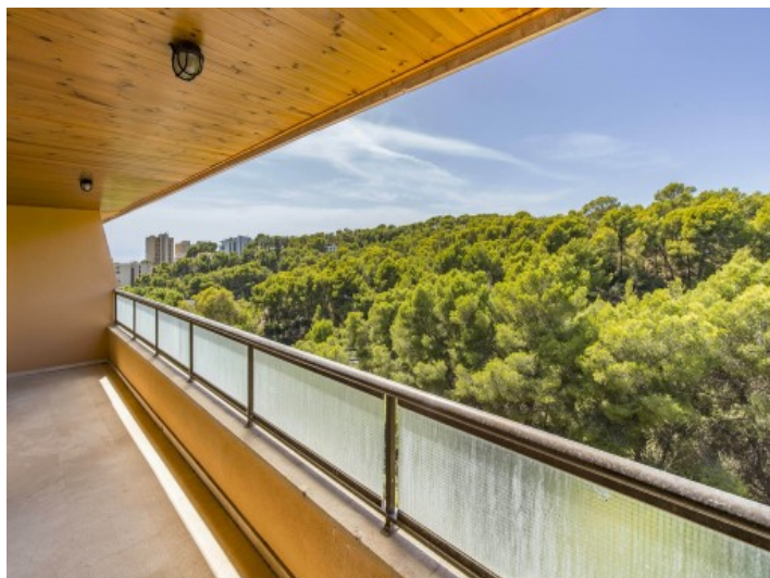
Balcony with a view