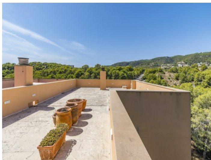
Ruf top terrace

All information is correct to the best of our knowledge. Errors and prior sale excepted. This prospectus is purely for information purposes. Only the notarized deed of sale is legally binding.