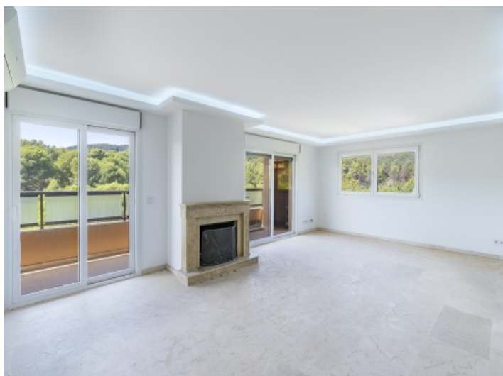
Living area with fire place