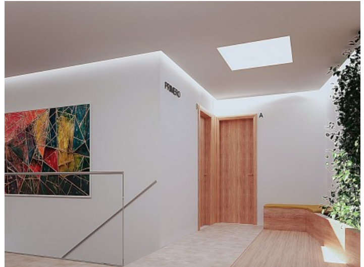
View of the floor area