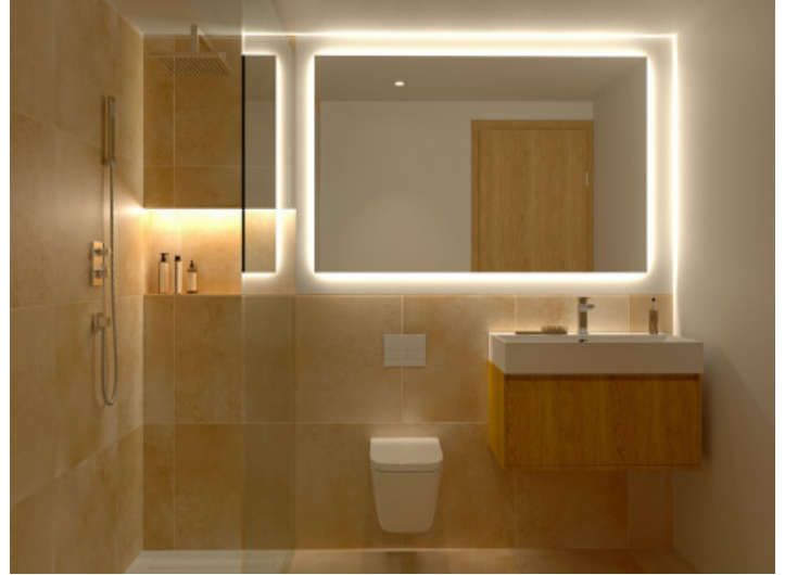
Bathroom with shower