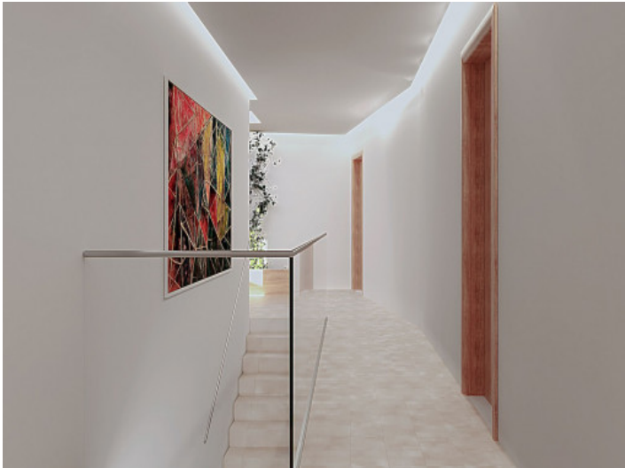
View of the floor area