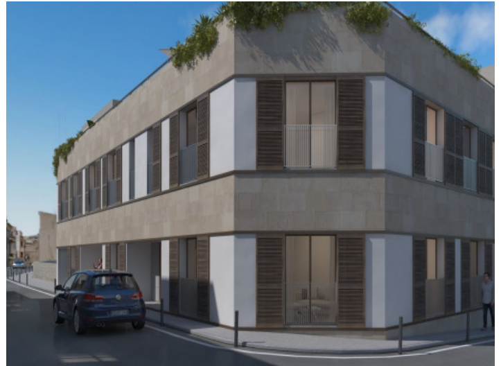
Exterior view of the residential building