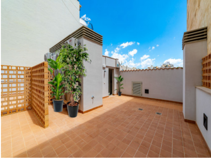
Beautiful roof terrace