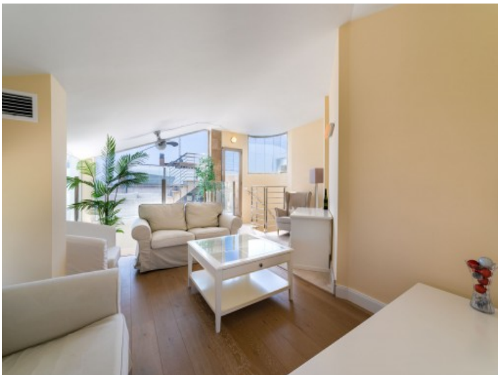
Upper living area