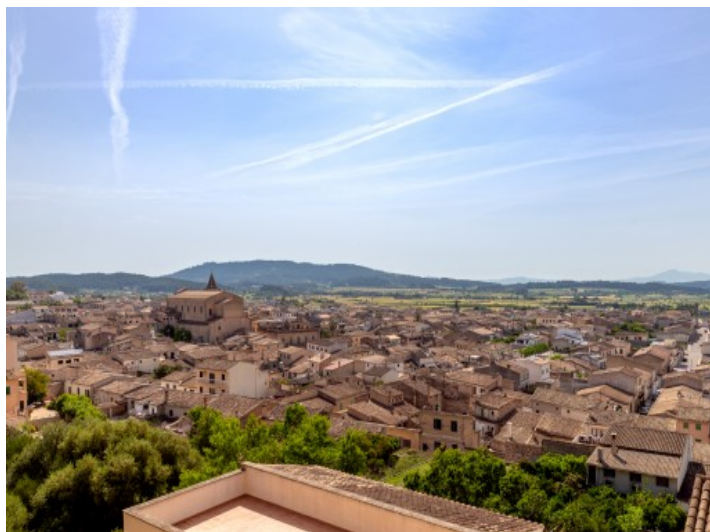
Stunning views over the town