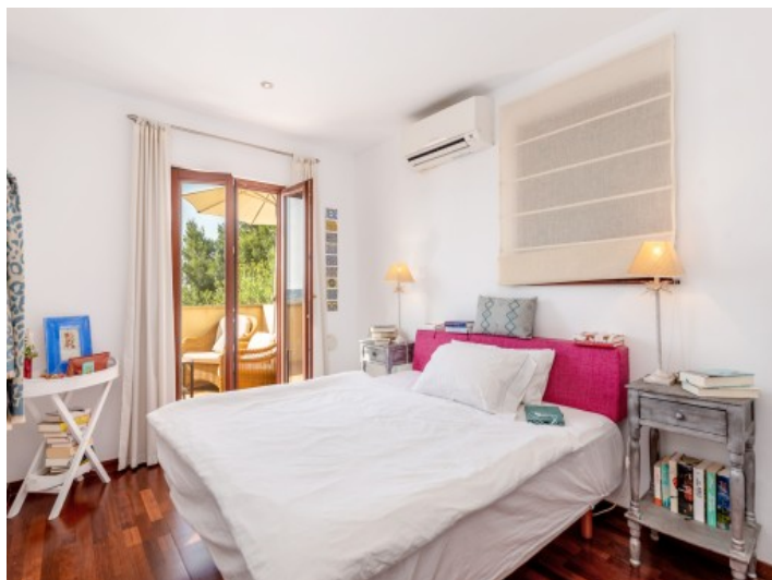
Double bedroom with terrace