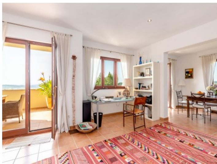
Lightflooded, open living and dining area