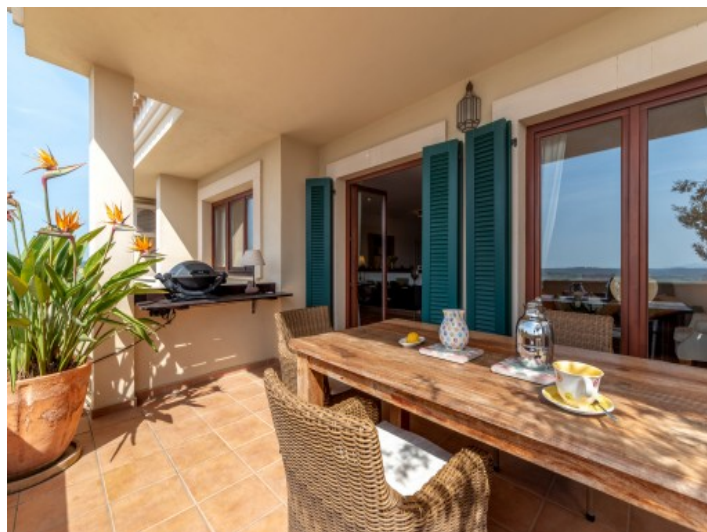
Covered terrace with dining area