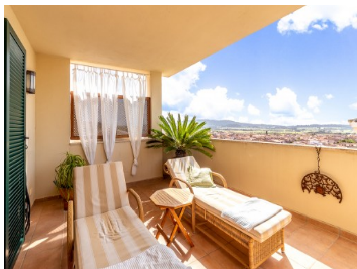
Tranquil lounge terrace