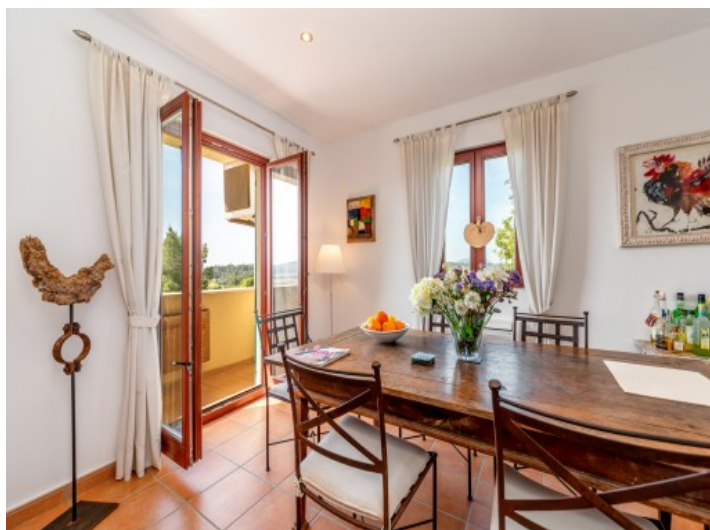
Beautiful dining area with terrace access