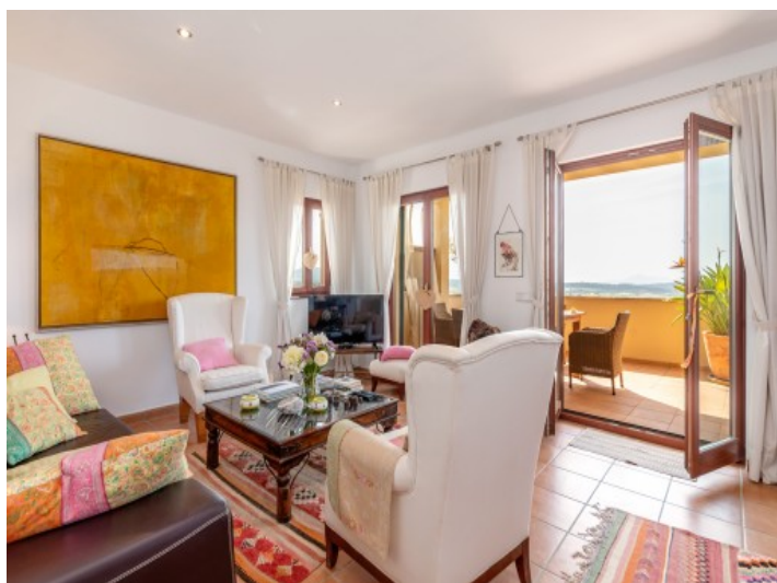
Comfortable living area with terrace access