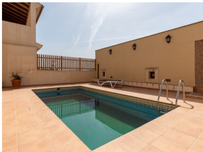
Communal area with pool

All information is correct to the best of our knowledge. Errors and prior sale excepted. This prospectus is purely for information purposes. Only the notarized deed of sale is legally binding.