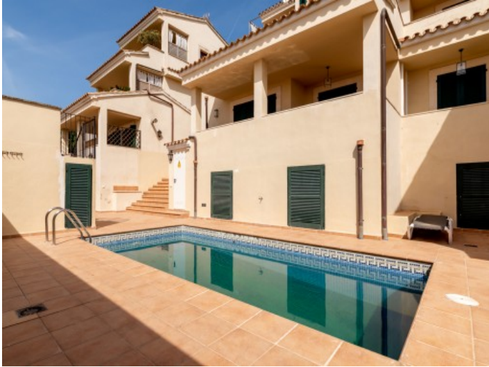
View of the complex with pool