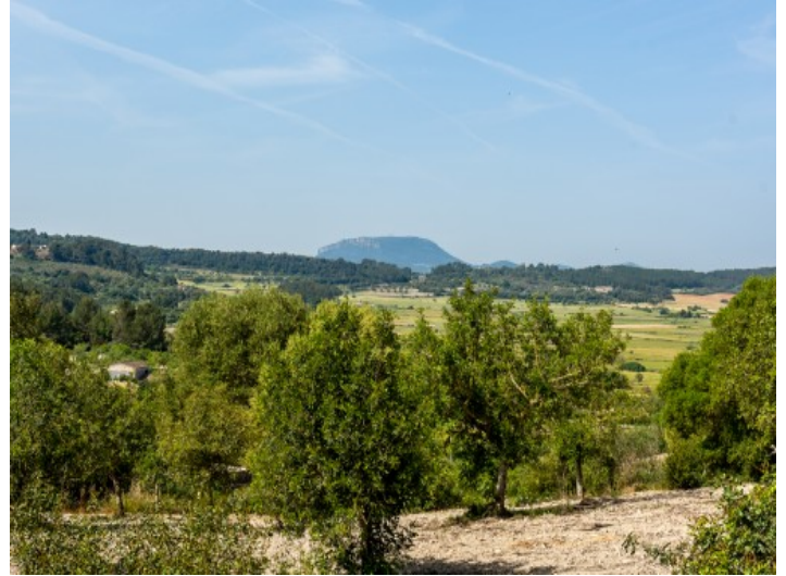
Unobstructed views over the surrounding nature

All information is correct to the best of our knowledge. Errors and prior sale excepted. This prospectus is purely for information purposes. Only the notarized deed of sale is legally binding.