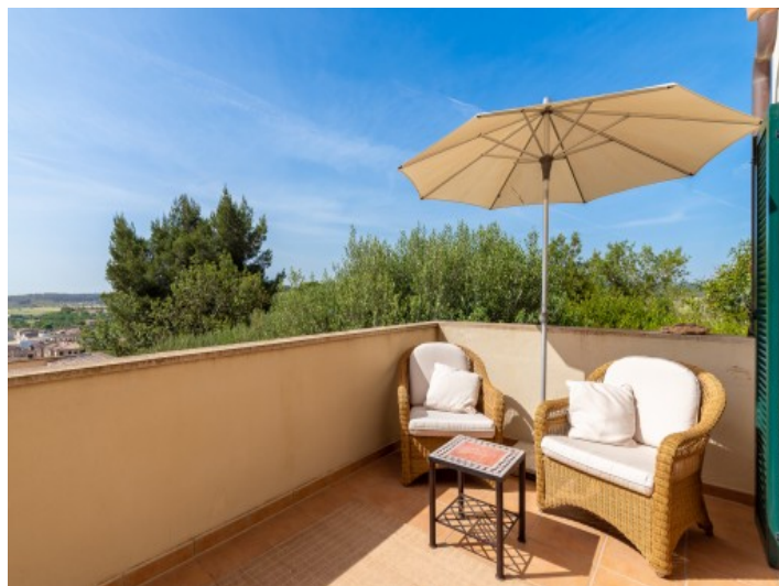
Lovely terrace with seating area