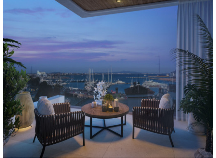
Balcony with a view by night