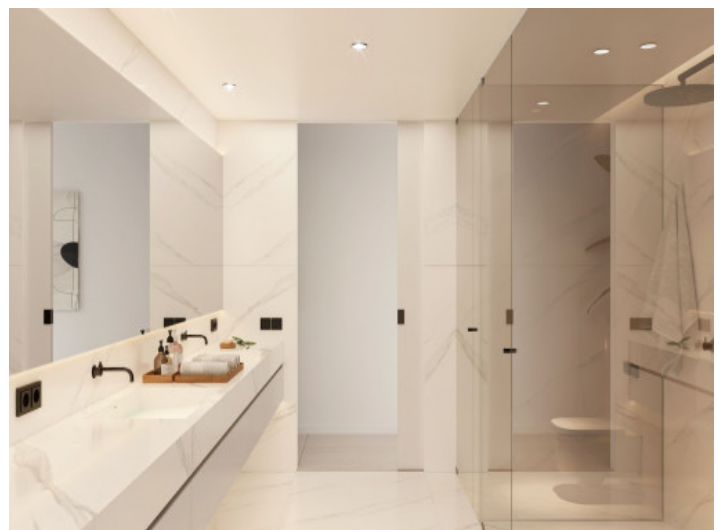
Elegant bathroom with walk-in shower

All information is correct to the best of our knowledge. Errors and prior sale excepted. This prospectus is purely for information purposes. Only the notarized deed of sale is legally binding.