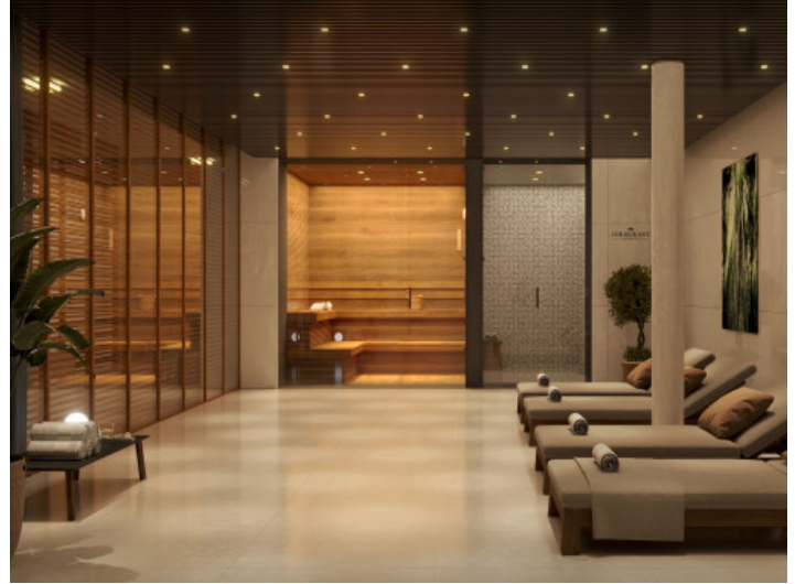
Fantastic community spa area