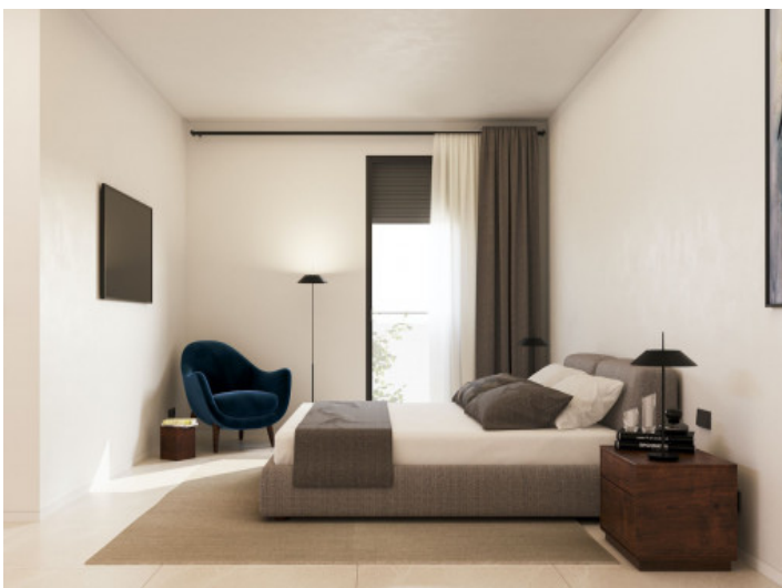
Cozy double bedroom