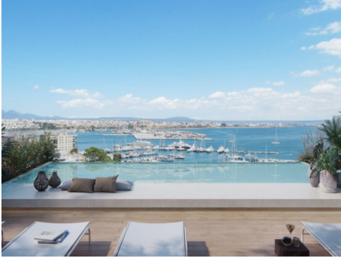
Pool and sea views