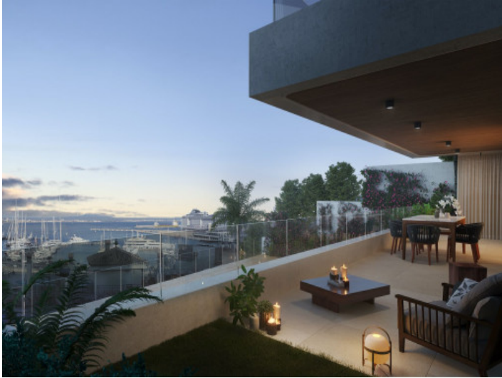
Terrace with sea views by night