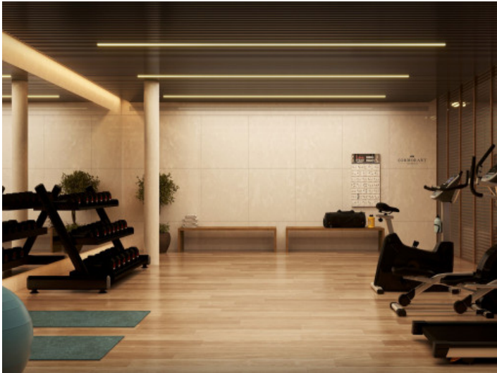
Spacious community gym