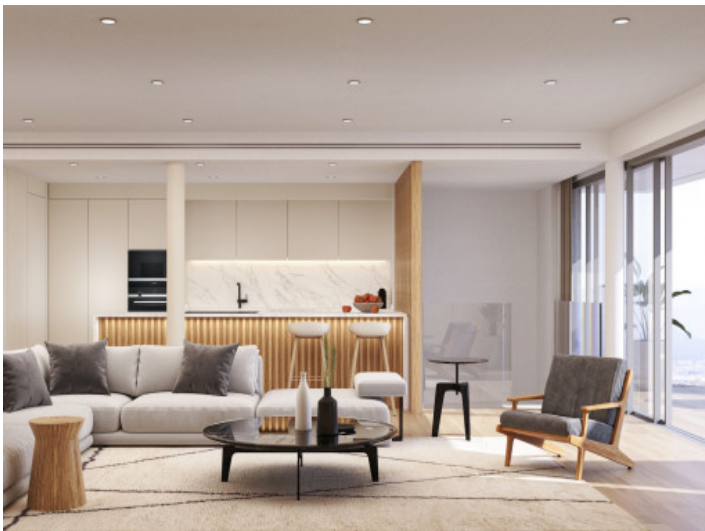
View to the kitchen