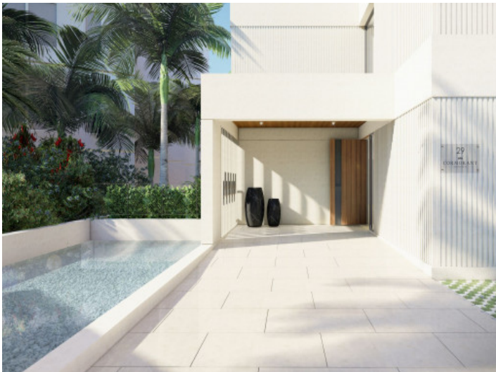
Noble entrance area