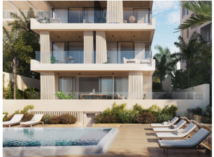
Exterior view of the residential complex