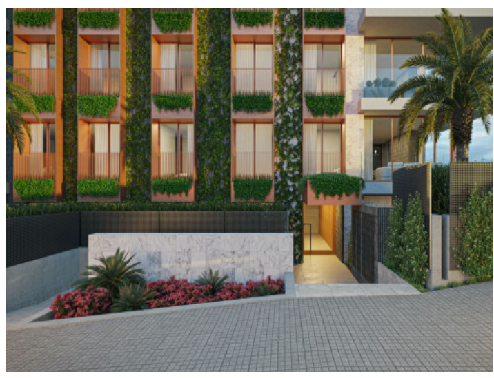
Exterior view of the building project