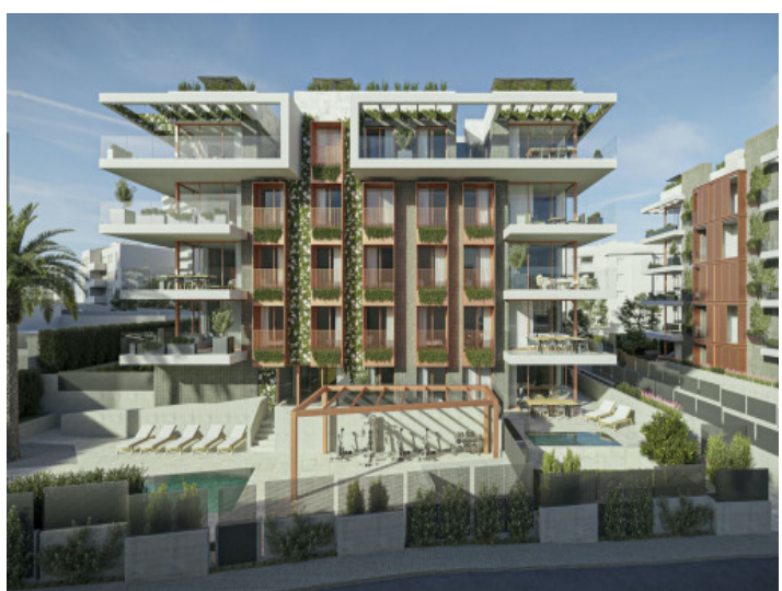
Exterior view and view of the pool area of the building project