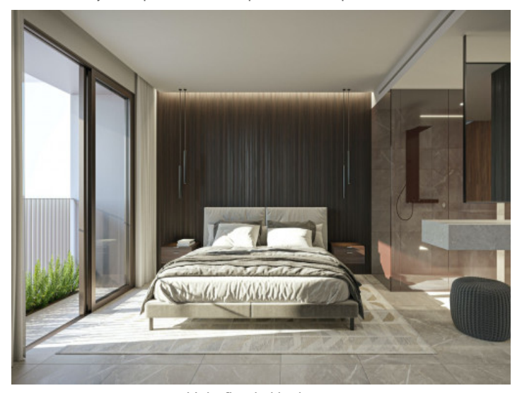
Light flooded bedroom