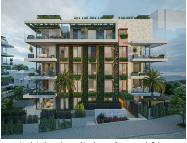
Newly-built penthouse with private roof top terrace in Palma