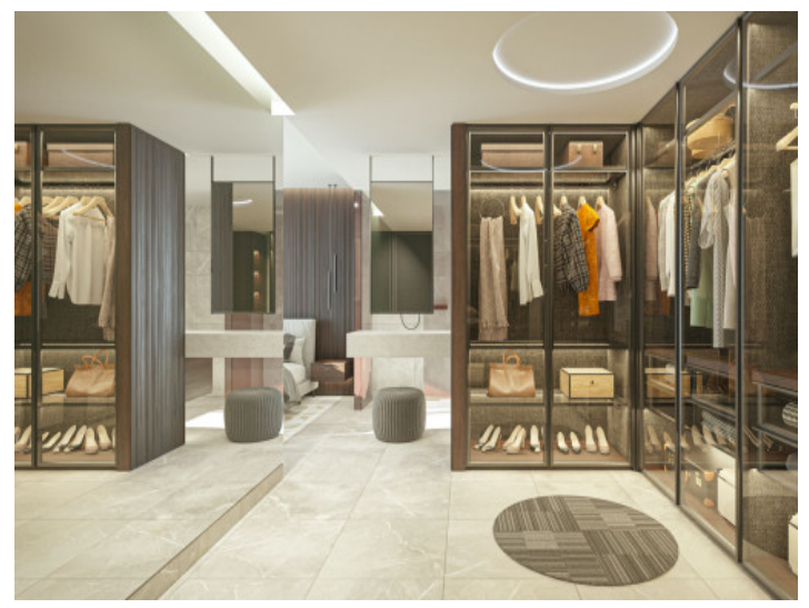
Practical dressing room of the penthouse