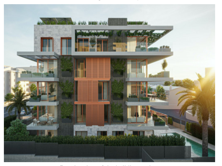
Exterior view of the building project

All information is correct to the best of our knowledge. Errors and prior sale excepted. This prospectus is purely for information purposes. Only the notarized deed of sale is legally binding.