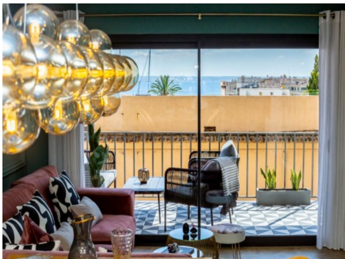
Living area with sea views