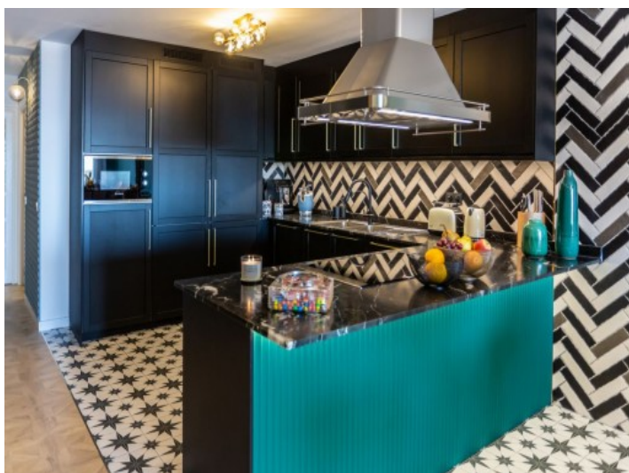
Modern kitchen in black