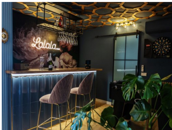
Stylish bar next to the kitchen

All information is correct to the best of our knowledge. Errors and prior sale excepted. This prospectus is purely for information purposes. Only the notarized deed of sale is legally binding.