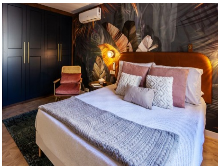
One of 5 bedrooms