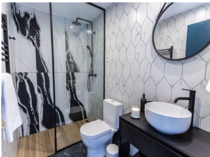
One of 5 bathrooms