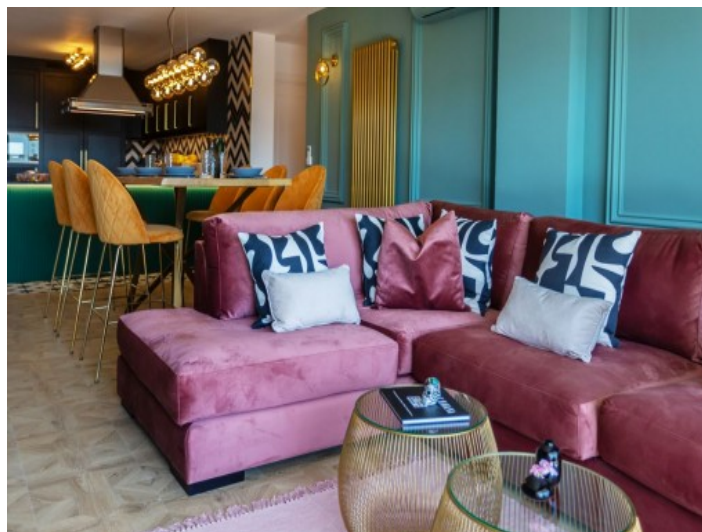
Open living and dining area