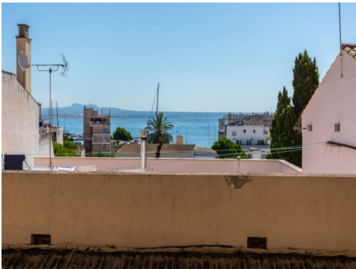
Views as far as the sea