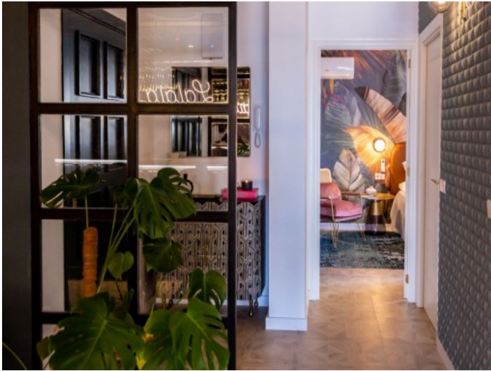
Inviting entrance area