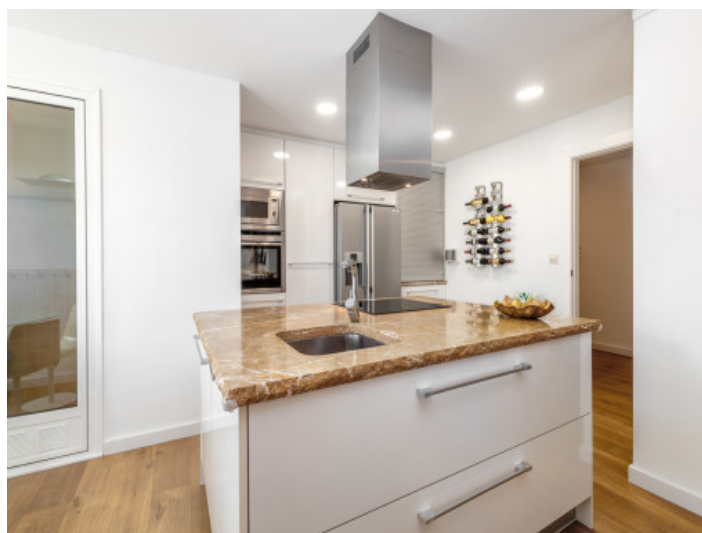
Open kitchen with cooking island