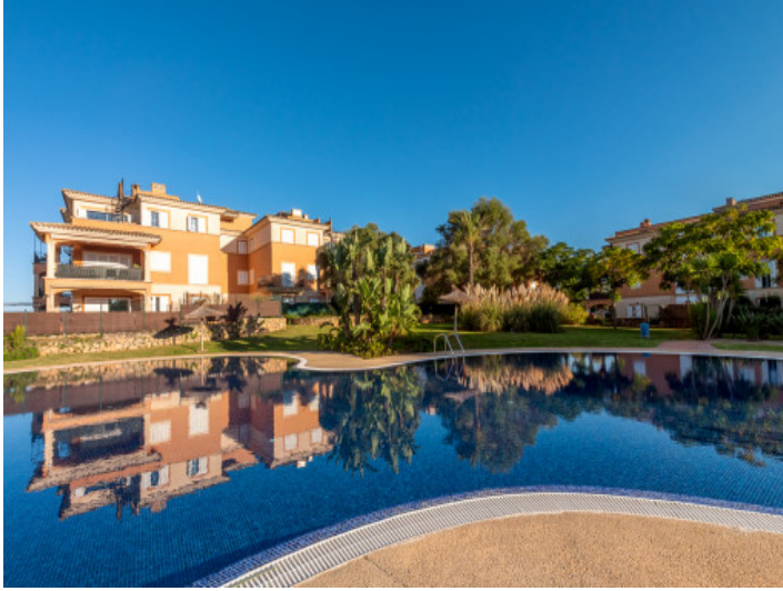
Large pool area

All information is correct to the best of our knowledge. Errors and prior sale excepted. This prospectus is purely for information purposes. Only the notarized deed of sale is legally binding.