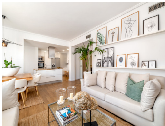
Beautifully designed living area