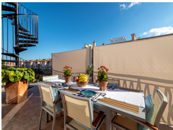
Lovely terrace with dining area