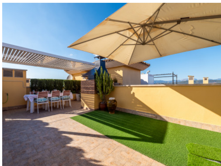
Large roof top terrace with bbq