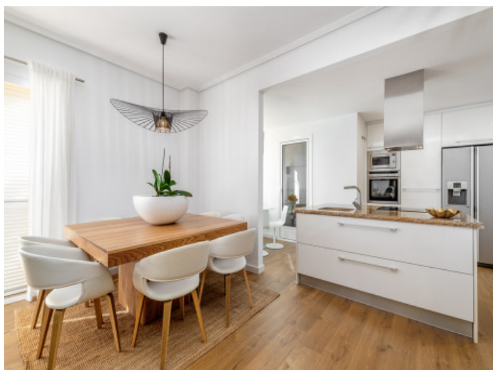
Modern dining area and kitchen