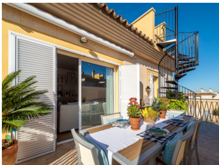
Sunny terrace with dining area