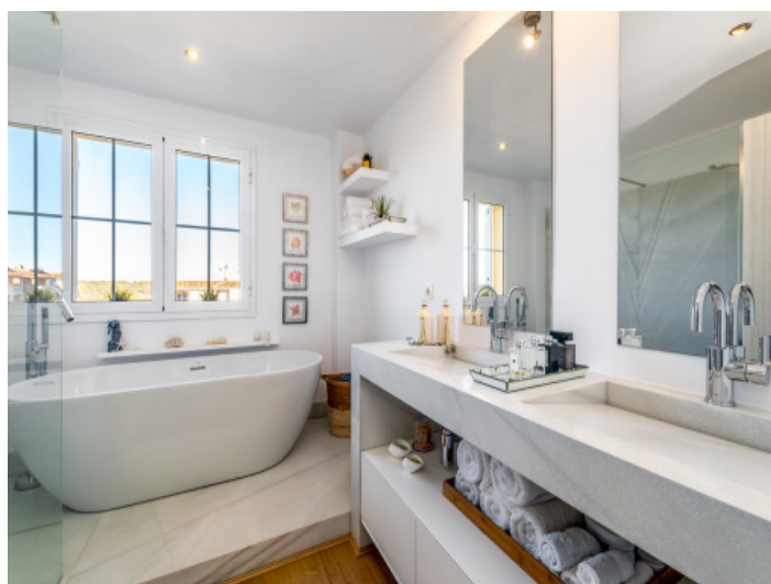
Beautiful bathroom with bathtub

All information is correct to the best of our knowledge. Errors and prior sale excepted. This prospectus is purely for information purposes. Only the notarized deed of sale is legally binding.