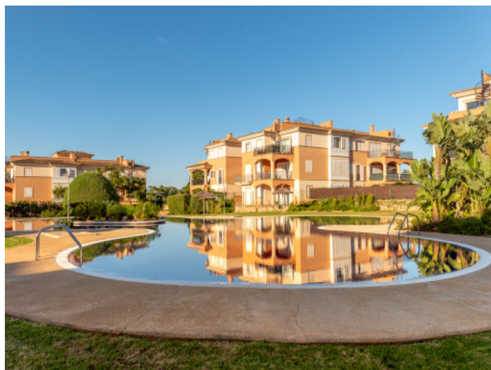
Well-tended communal pool

All information is correct to the best of our knowledge. Errors and prior sale excepted. This prospectus is purely for information purposes. Only the notarized deed of sale is legally binding.